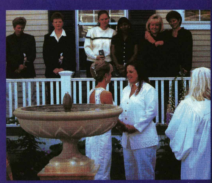
The Oxford House already has six wedding receptions and ceremonies, like the one pictured above, scheduled for this season. The guesthouse hosted no more than four last year.

ting married in Provincetown. Can out-of-state couples obtain a license? Where can they host a reception? Order a cake? Hire a photographer? The steady stream of inquiries has prompted Town Hall to add a "Local Wedding Planning Services" page to their website. But the calls haven't slackened.