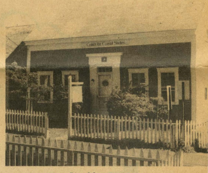
one of the buildings floated from Long Point

A new lighthouse tower was built on Long Point during 1875, and that tower was eventually replaced by the present automatic lighthouse and its accompanying foghorn. Long Point today is owned by the Cape Cod National Seashore. The area is a favorite place for boaters, fishermen, and picnickers to congregate.