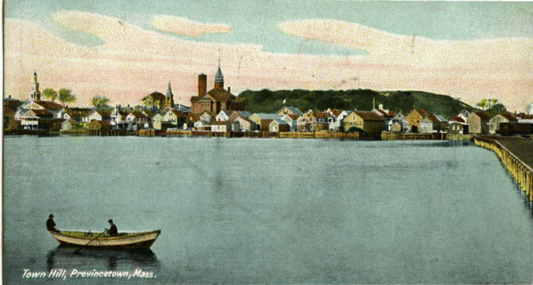
Town Hill, Provincetown, Mass.