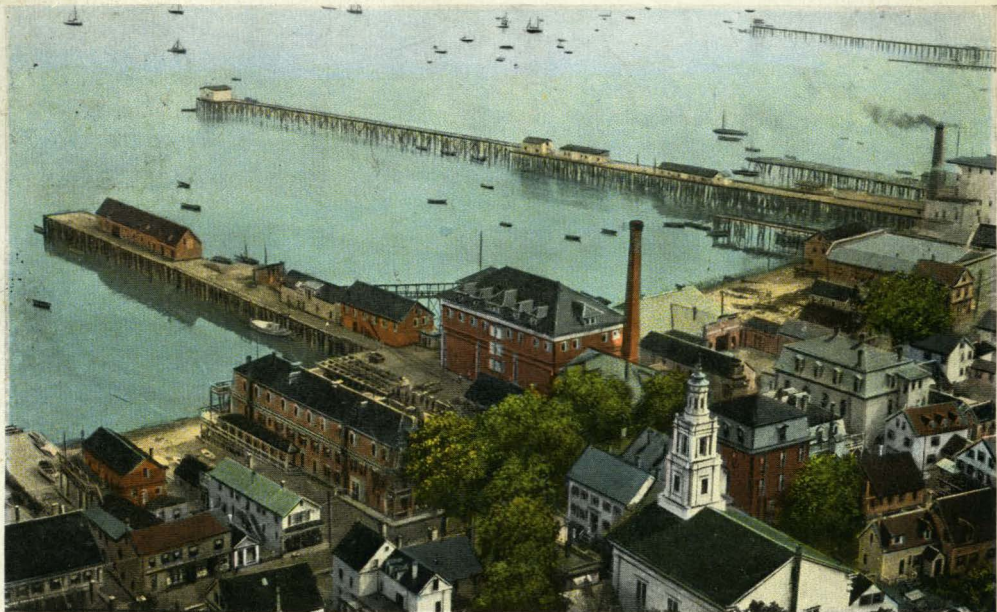
VIEW FROM PILGRIM MEMORIAL MONUMENT, PROVINCETOWN, MASS.