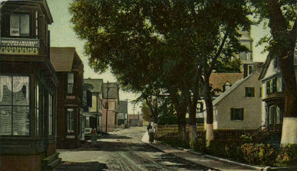
COMMERCIAL ST., PROVINCETOWN, MASS. 18 FEET IN WIDTH, WITH 4 FOOT SIDEWALK.