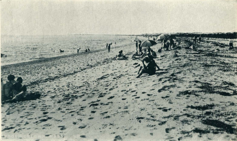
New Beach-Provincetown, Mass.