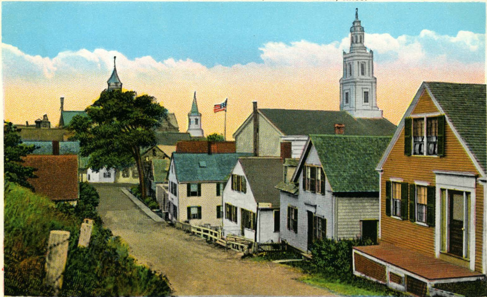
BRADFORD STREET, "THE BACK STREET," LOOKING EAST, PROVINCETOWN, MASS.