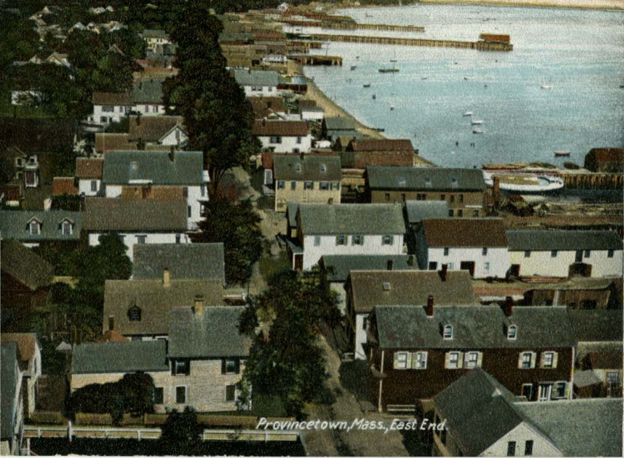
Provincetown, Mass., East End.