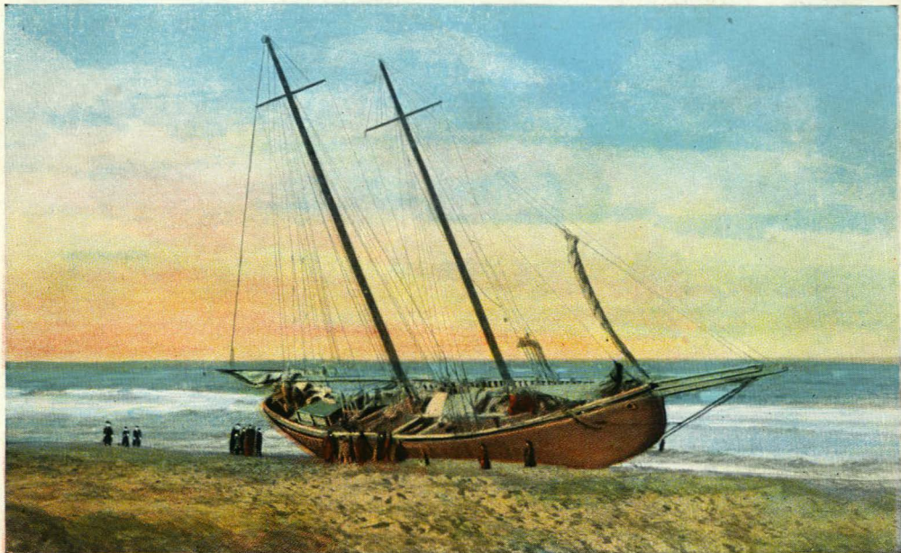
179 "RUM RUNNER" WRECKED AT RACE POINT COAST GUARD STATION, PROVINCETOWN, CAPE COD, MASS.