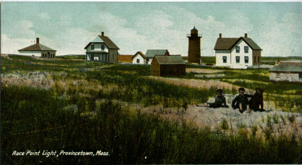
Race Point Light, Provincetown, Mass.