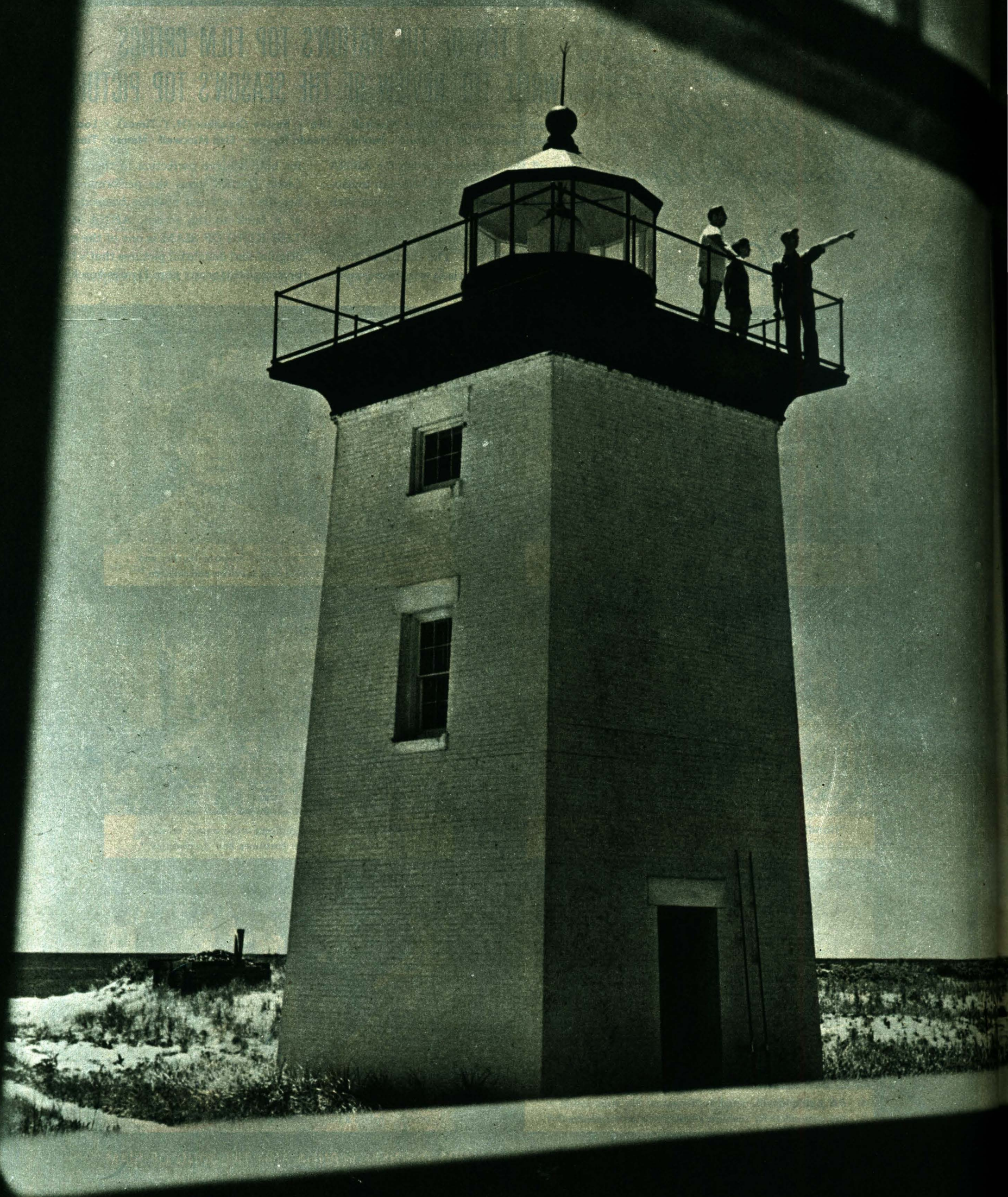
Wood End Lighthouse stands on Cape Cod like a sturdy sentinel. Its light reaches seamen 12 miles from shore