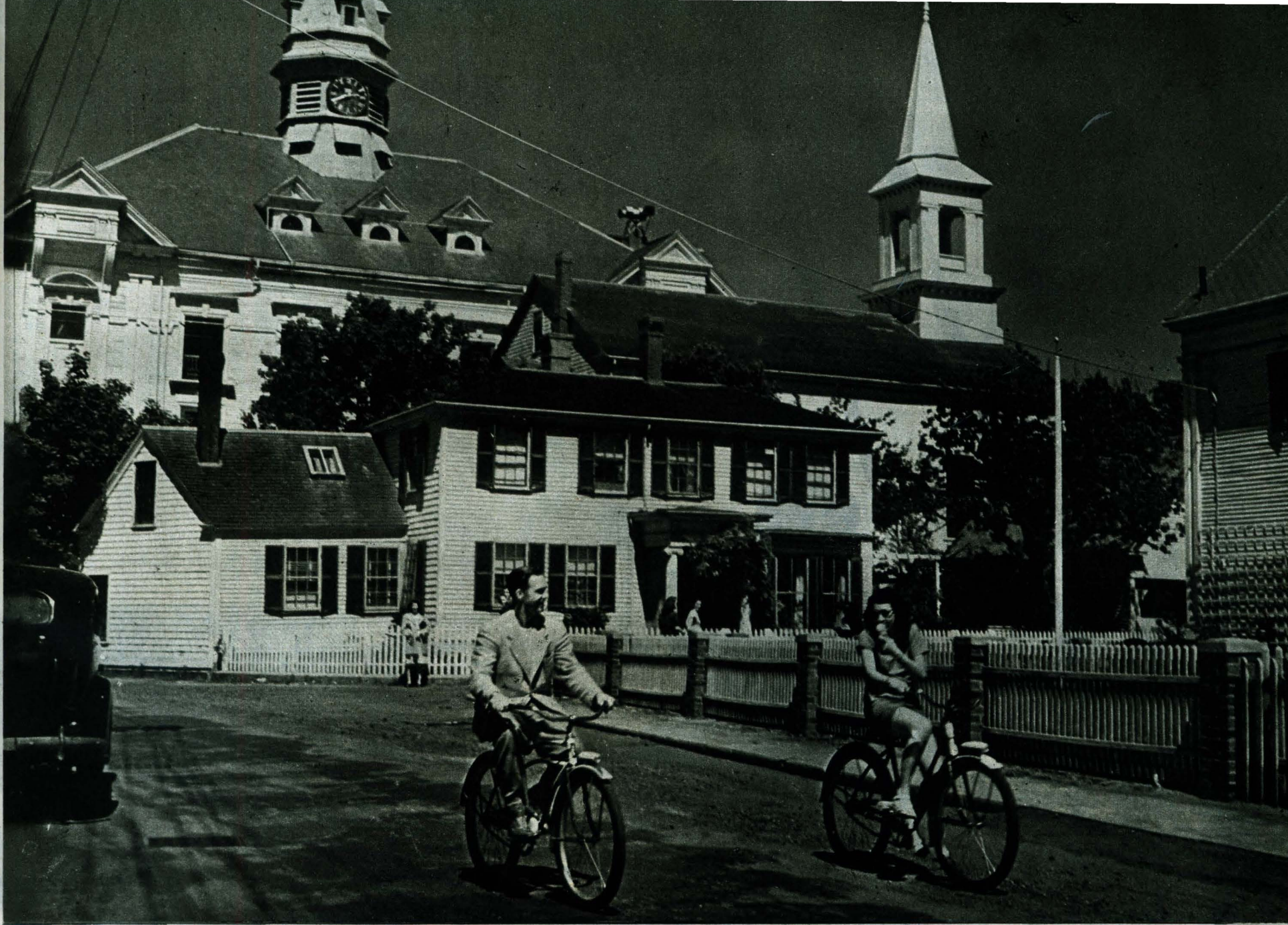
Kay and Dick find bicycling adds fun to sightseeing. She enjoys an ice cream cone as they pedal past Provincetown's Victorian Town Hall (upper left),

and the Church of the Redeemer. The village is only two streets wide, but skirts the Cape's inner shore for four miles. Its normal population is 4,000.