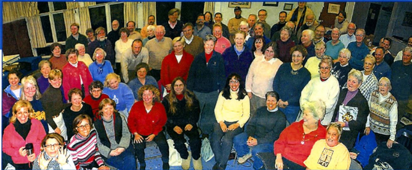
The 80 vocal members of the Outer Cape Choral