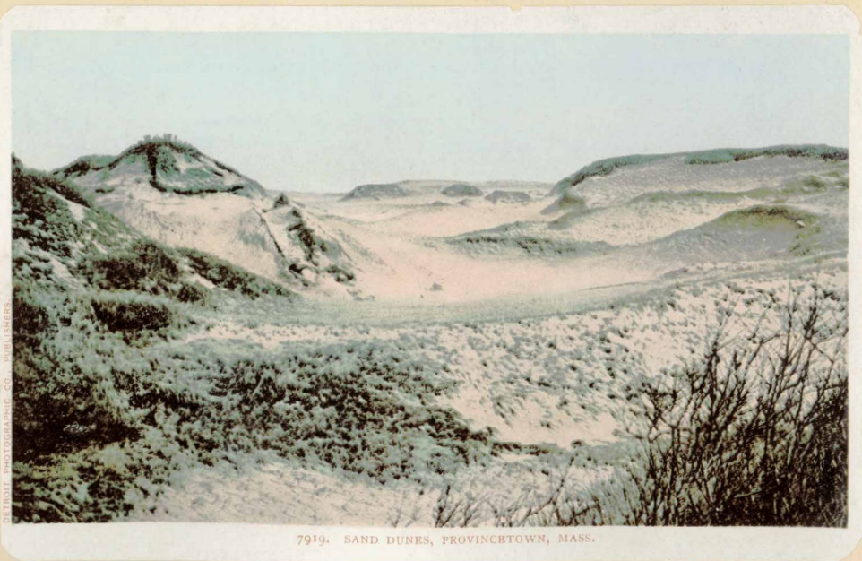
7919. SAND DUNES, PROVINCETOWN, MASS.