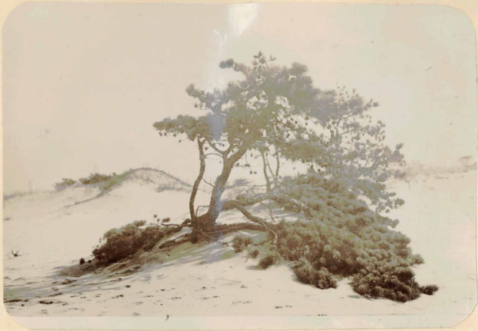
A lone pine struggles against its inevitable fate of being buried forever beneath the shifting sands. Note standpipe and Monument at the left.