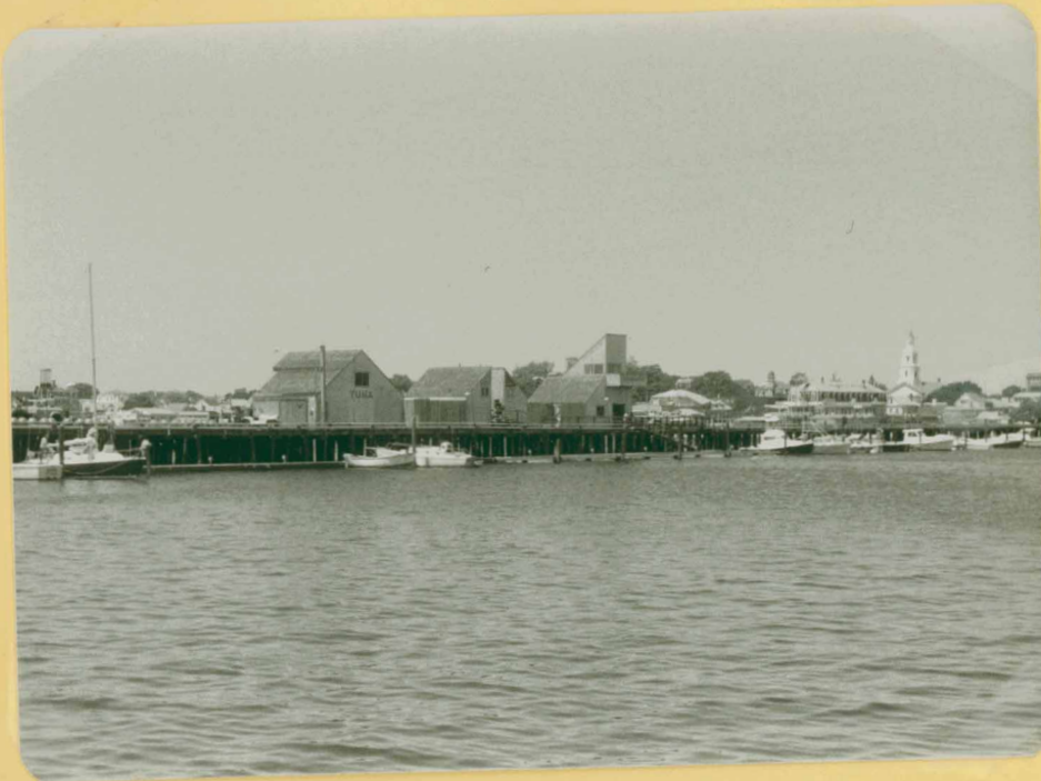
Fisherman's Wharf facing West, now with the new buildings on it. - 1981