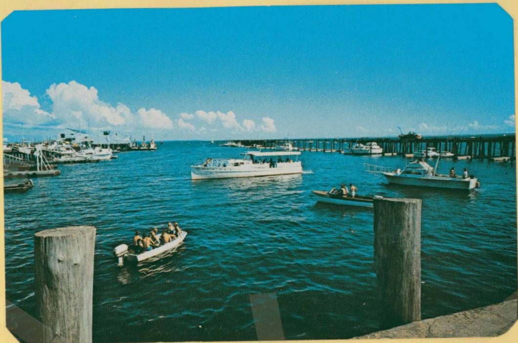
Railroad, or MacMillan Wharf, left, and the now repaired Fisherman's Wharf, right 1980