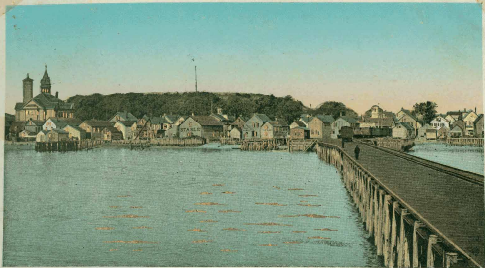
Town Hill, "Site of proposed Pilgrim Monument", Provincetown, Mass.

Made in Germany: Provincetown Advocate, Provincetown, Mass. (15955)