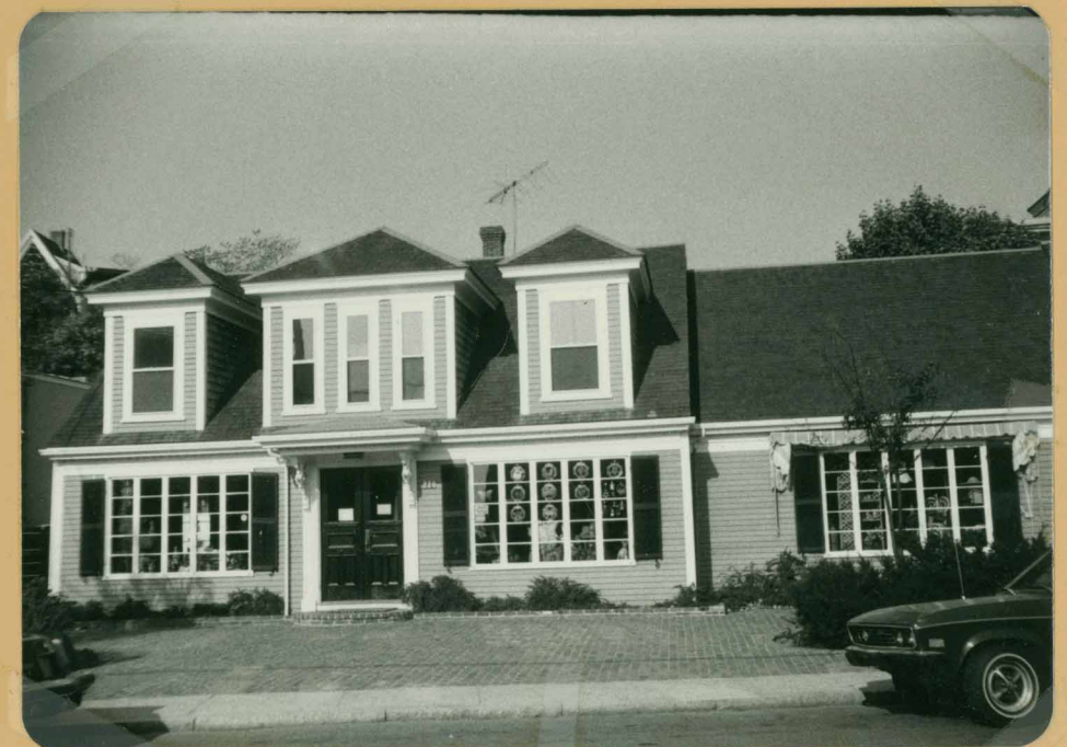
Shop opposite Seamen's Savings Bank - Oct 1980