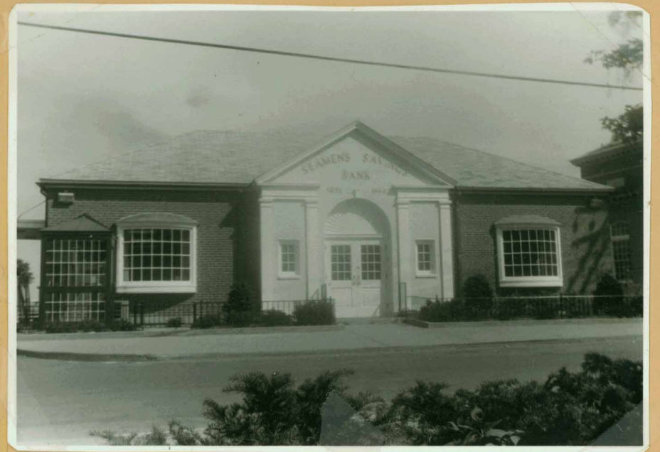
The New Seaman's Savings Bank, where The Cape Cod Garage used to be - June 1977

The plans are not formalized, so the type and general architecture is not available. In the next few months, plans will have been completed meeting the requirements of the Banking Department and the Trustees of the Bank.