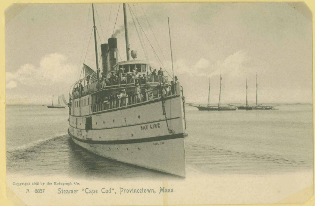
A 6837 Steamer "Cape Cod", Provincetown, Mass.