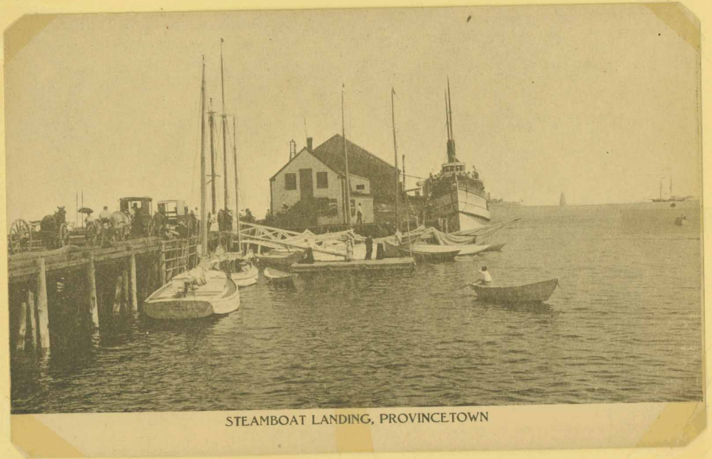
STEAMBOAT LANDING, PROVINCETOWN