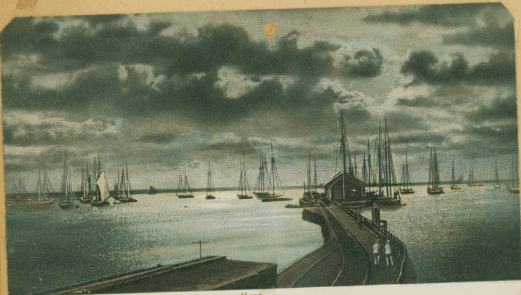
12100—R. R. Wharf by Moonlight, Provincetown, Mass.