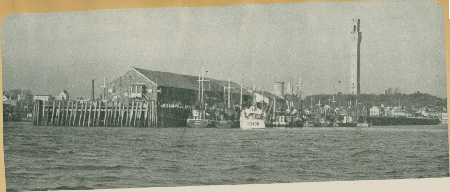
PILGRIM MEMORIAL MONUMENT— COMMEMORATING THE FIRST LANDING PLACE OF THE PILGRIMS