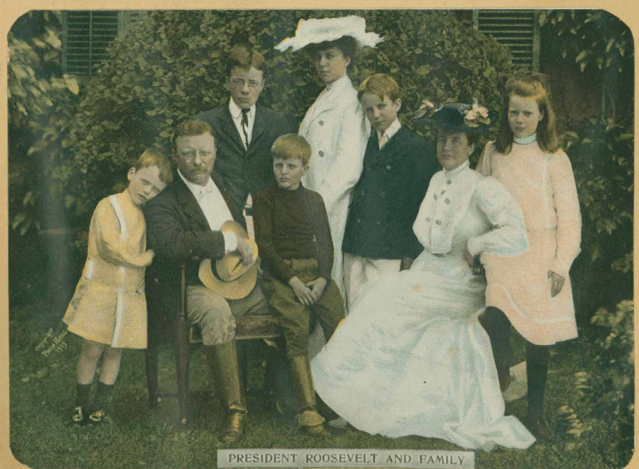
PRESIDENT ROOSEVELT AND FAMILY