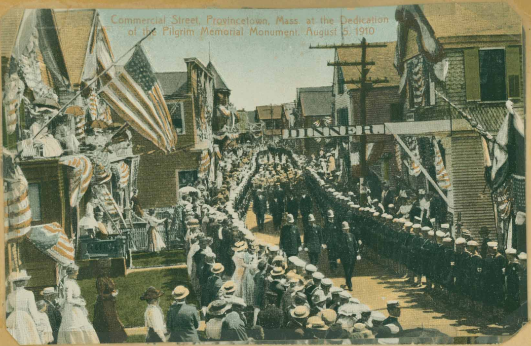
On the way up Monument hill to the Laying of the Corner Stone.