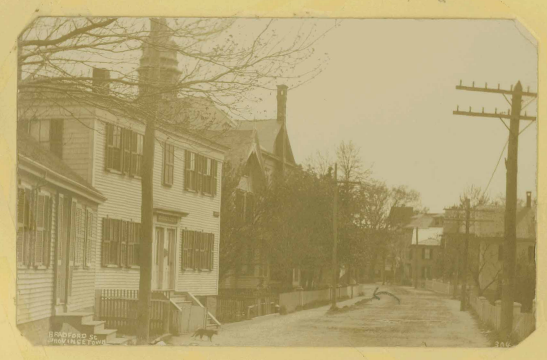
Bradford Street facing West, behind the Town Hall (See tower). Ryder Street, Arrow - 1910

Provincetown Advocate, Thursday, July 15, 1976