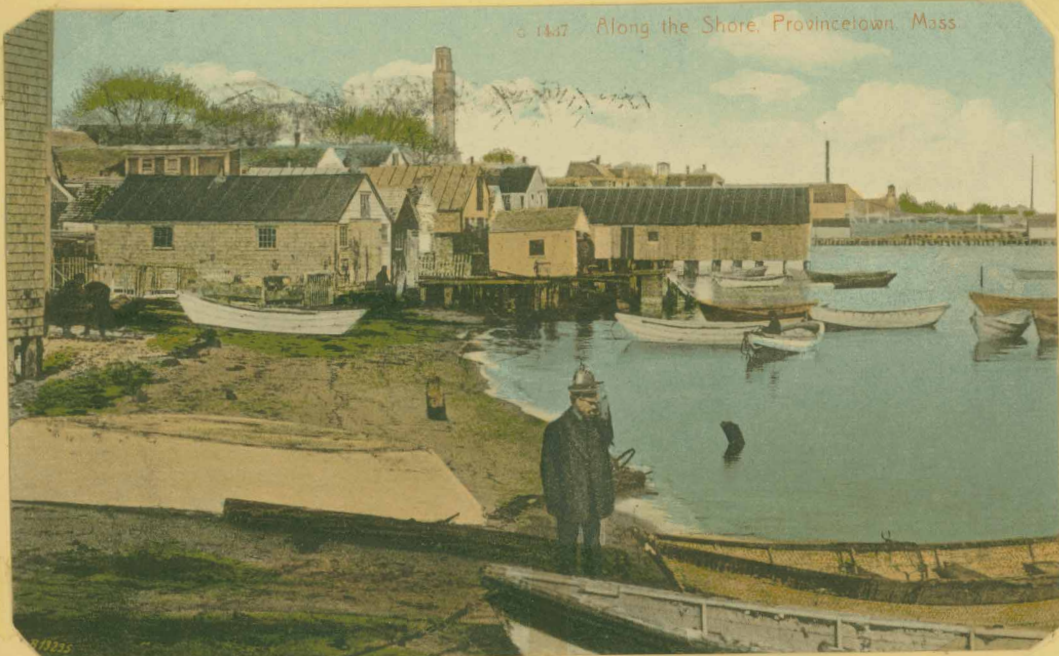
1910 - A corner of the Cape Cod Cold Storage showing at the left