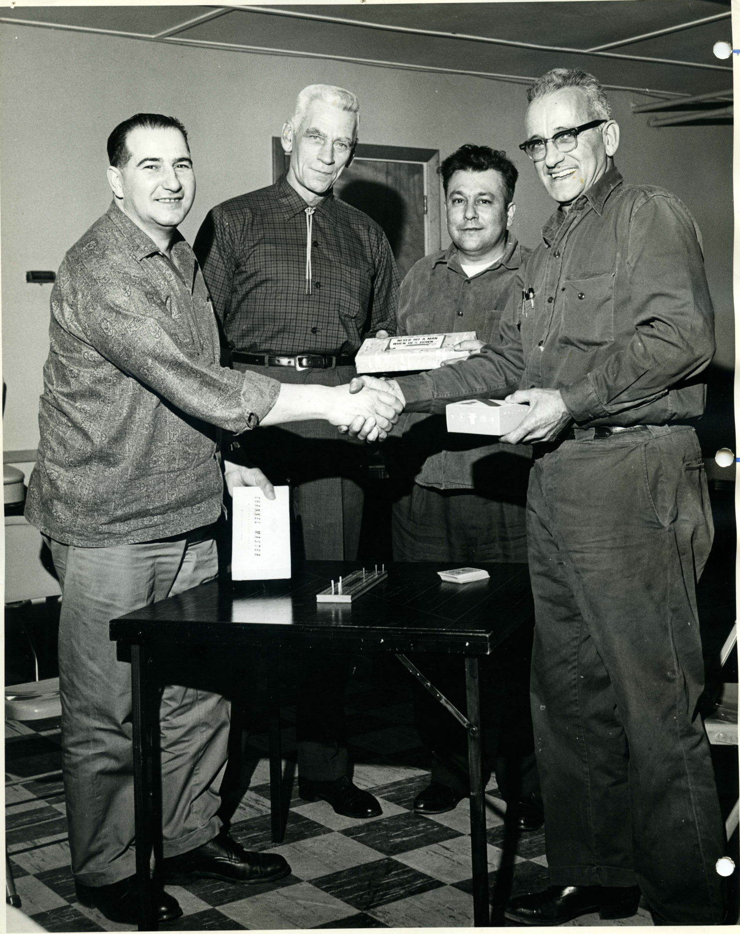
VFW Cribbage Championship - February 1964