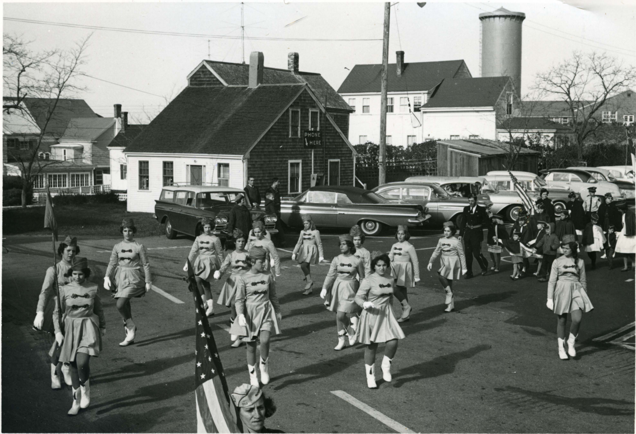
Veterans Day 1961