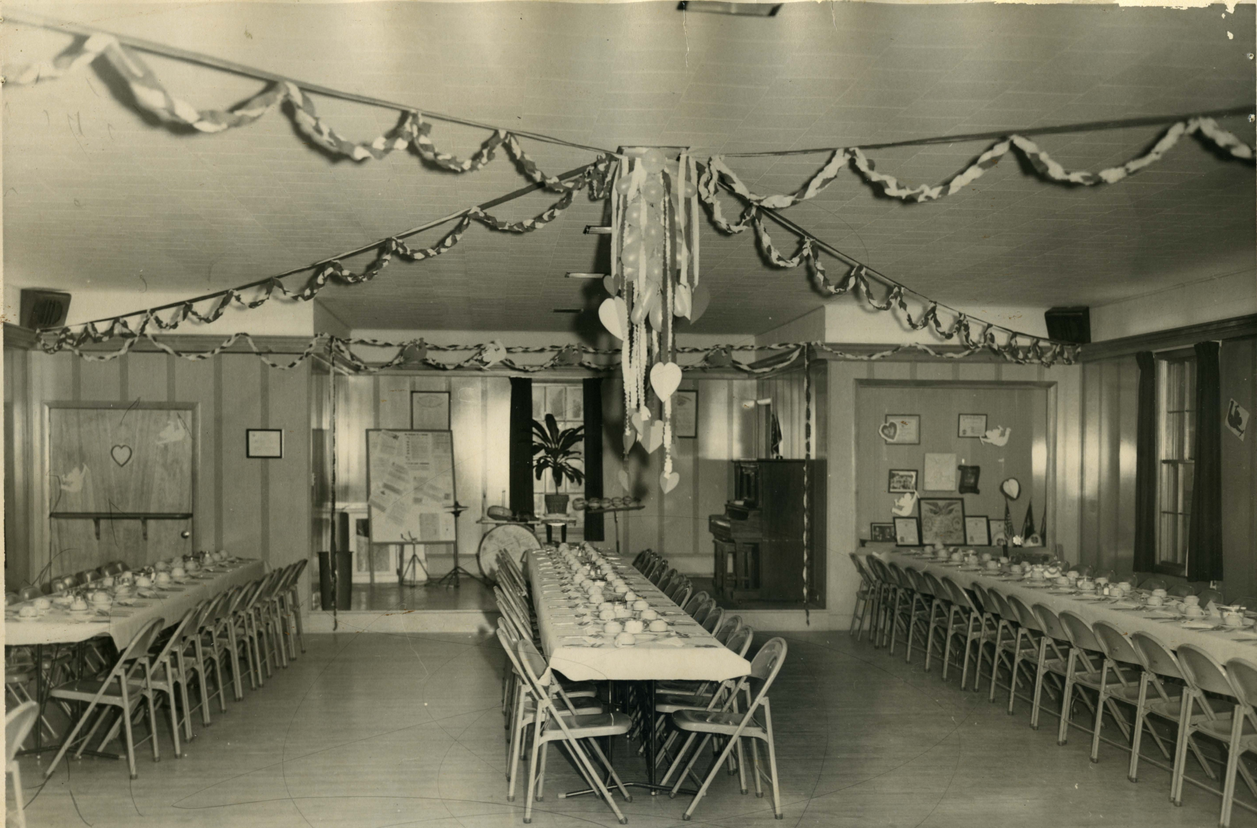
FEB 14, 1962 VALENTINE'S ROAST BEEF DINNER