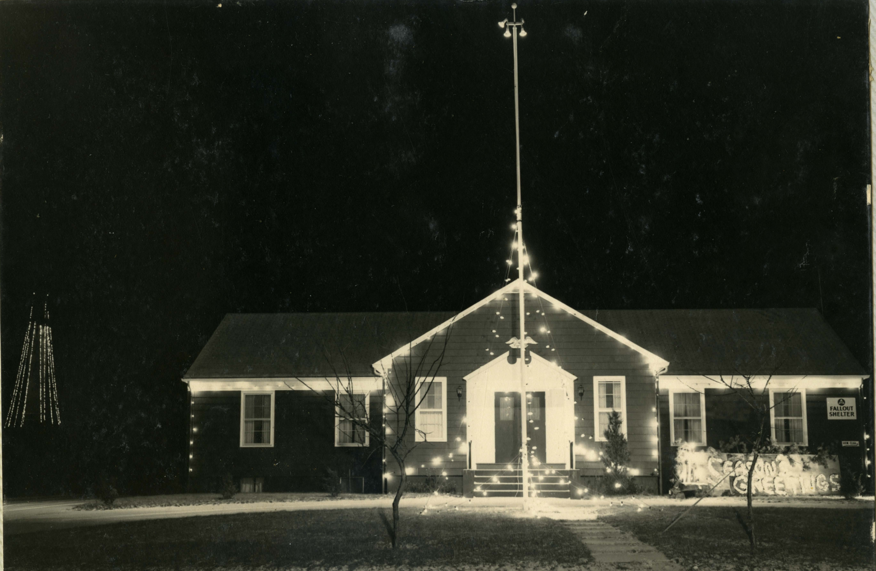
CHRISTMAS LIGHTS JFW HALL 1961 PIGRIM IN BACKGROUND LEFT