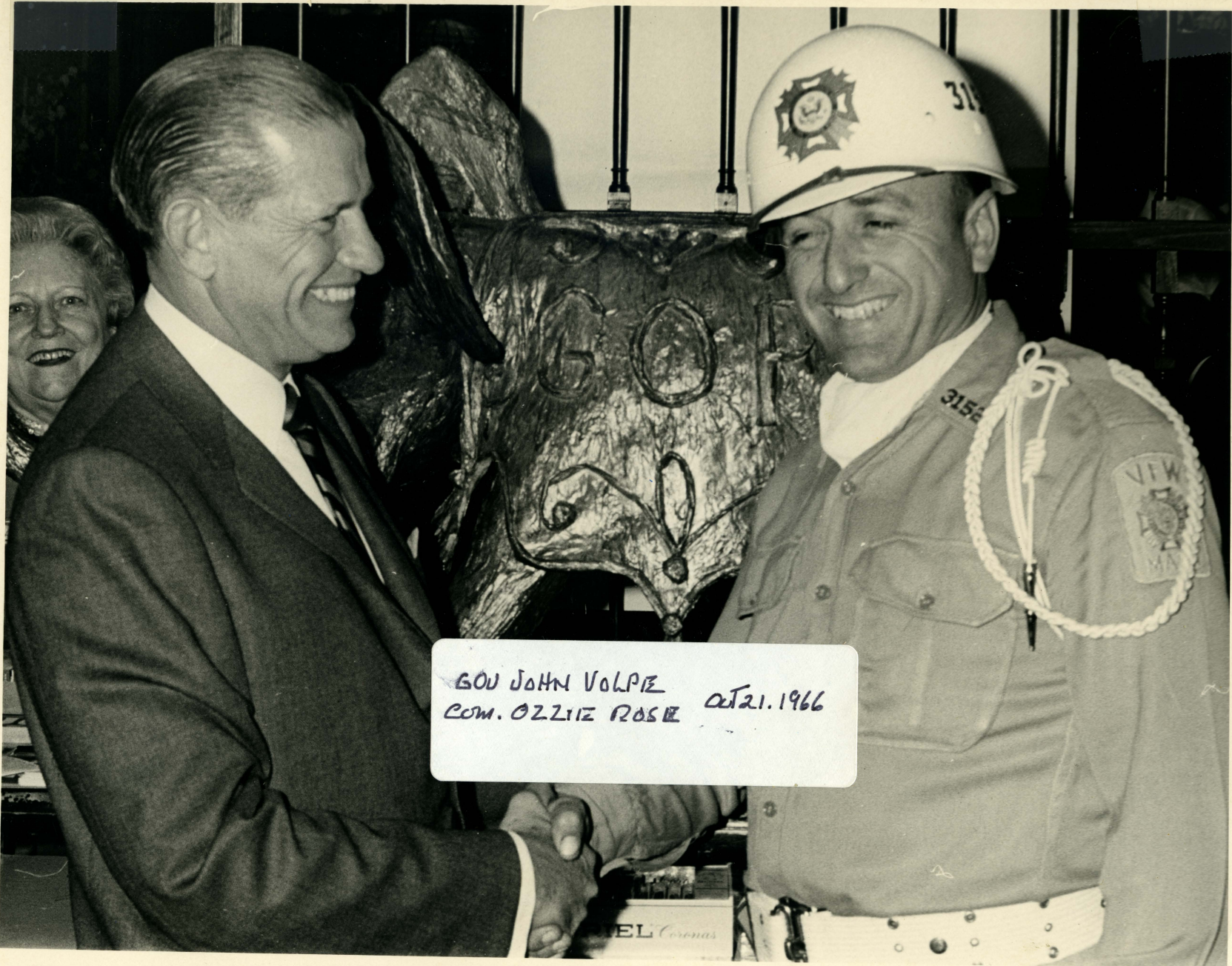
GOV JOHN VOLPE COM. OZZIE ROSE OCT 21, 1966