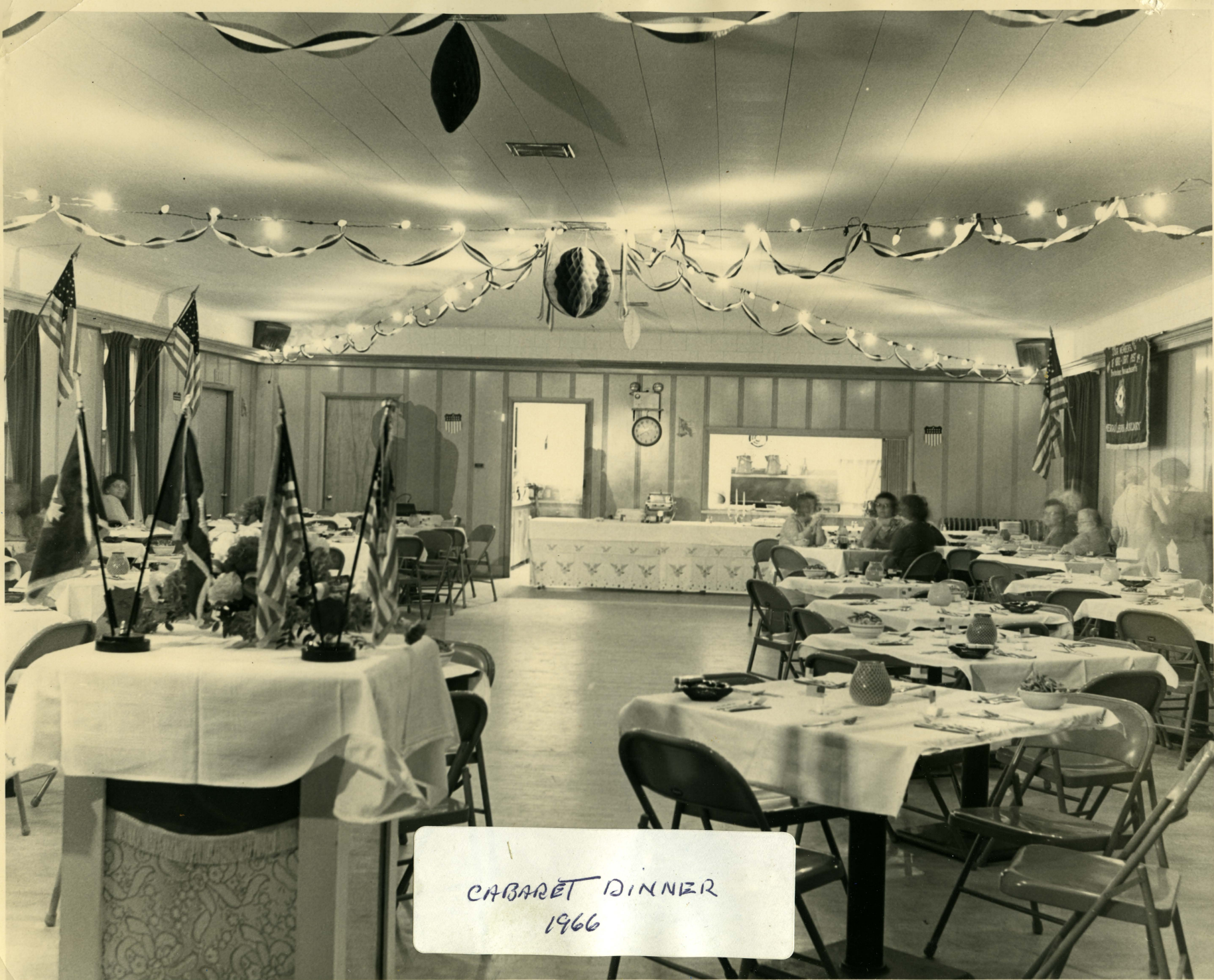
CABARET DINNER 1966