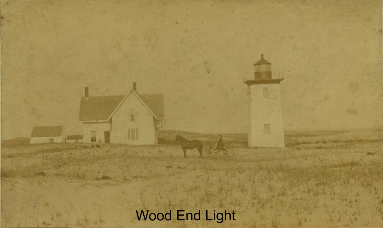
Wood End Light