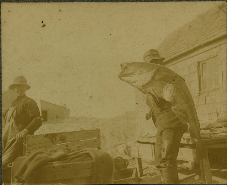
SEVENTY POUNDS OF CODFISH, ALL IN A PIECE