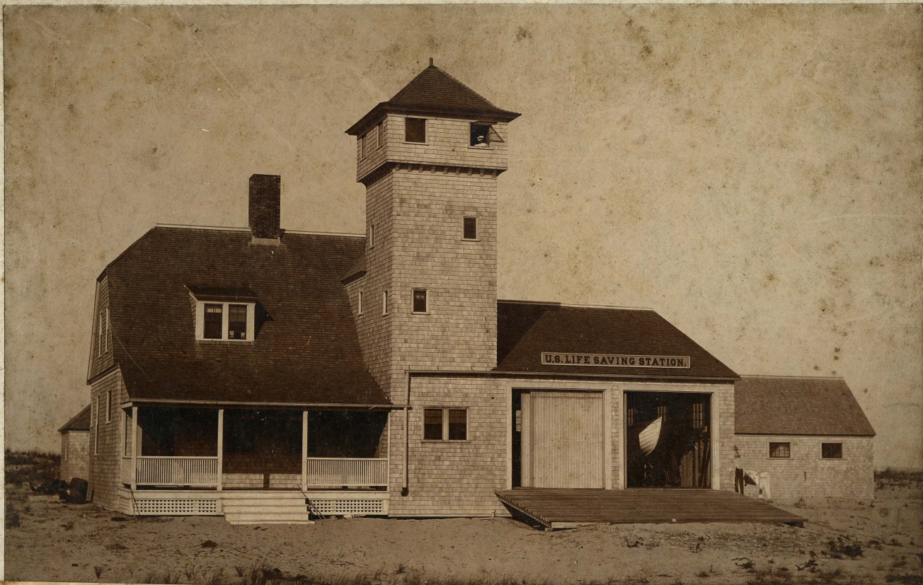
Keeper Sparrow's Old Quarters