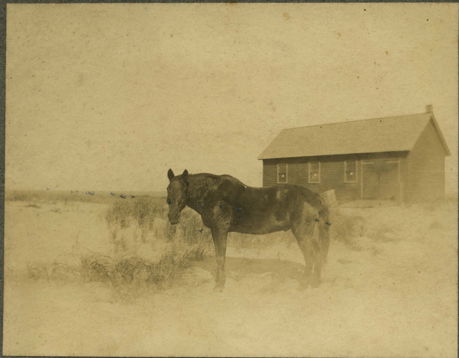
Old Daisy - Peaked Hill Bar Horse