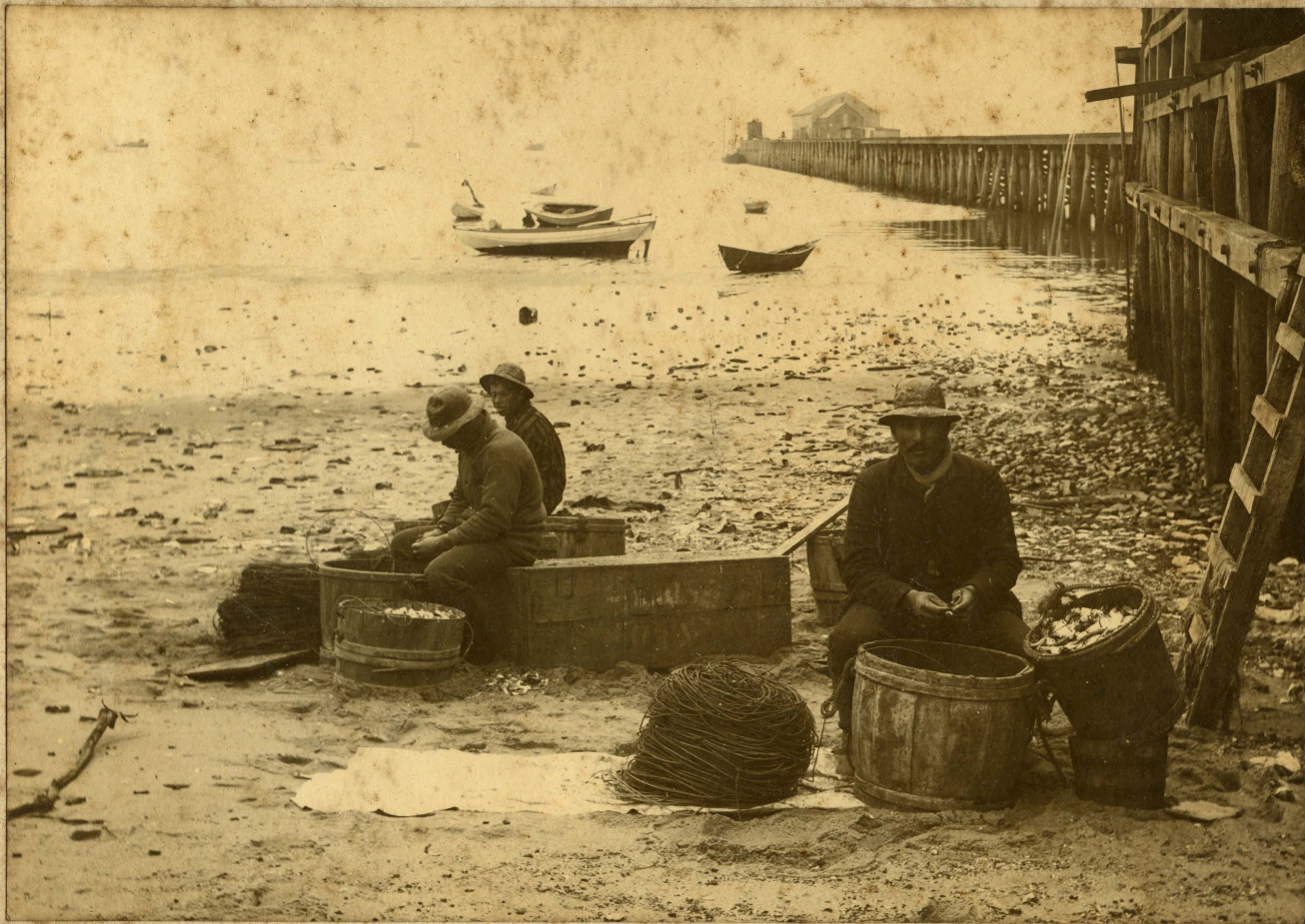
Baiting Trawls near Railroad Wharf