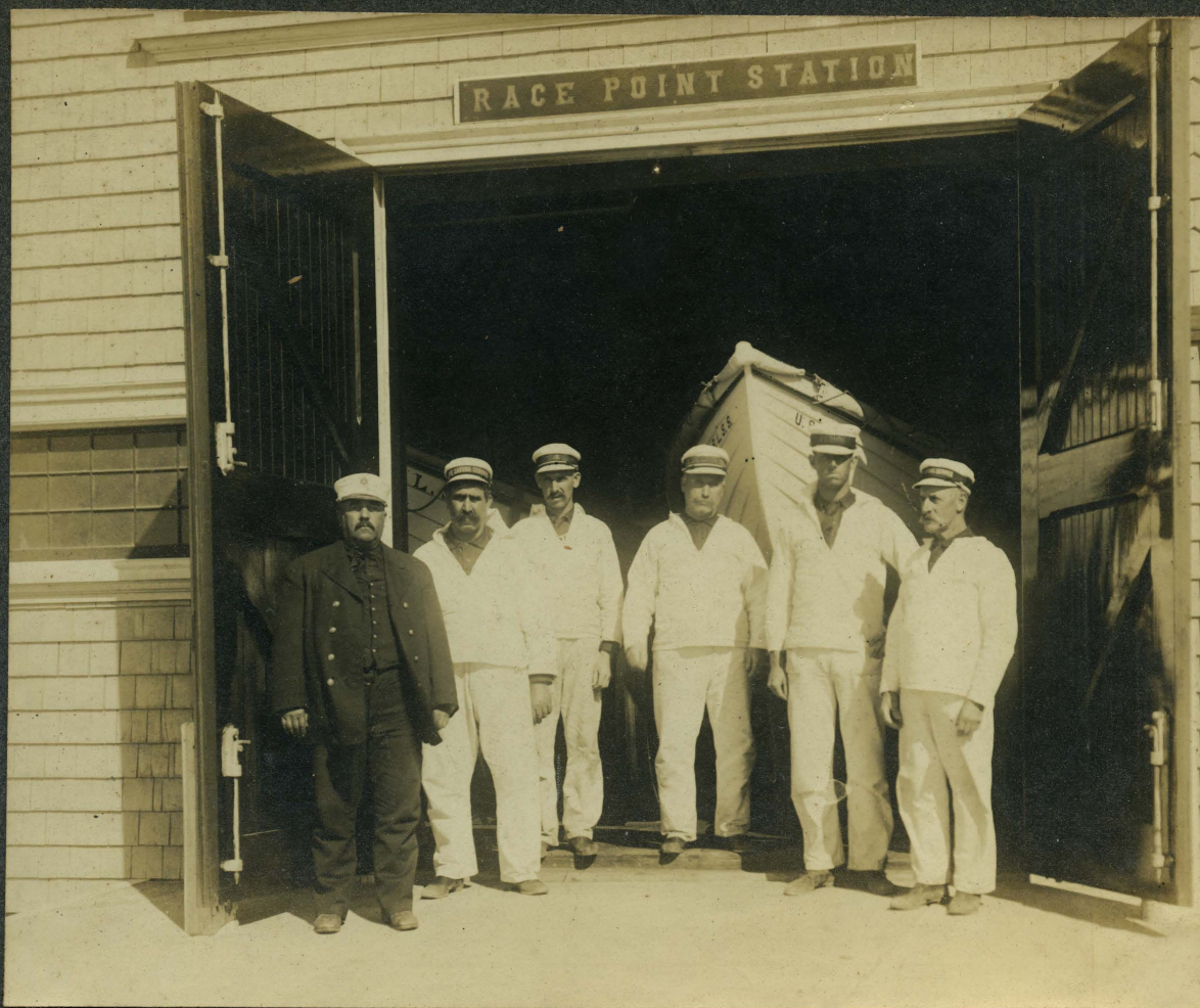
Keeper and Surfmen of Race Point Life Saving Station

Men Who Fired the First Shot On the Morning of the Three-Barge Disaster