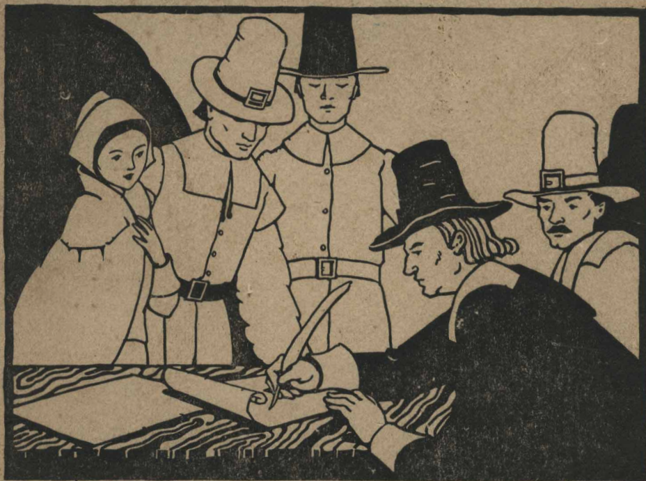
The Signing of the Compact