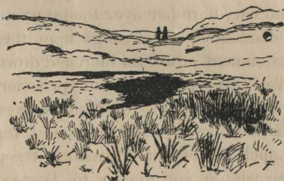
DEAD MEN'S HOLLOW.

the Provincetown and Truro men over the division of the spoils. This is denied by some of the local accounts, but it is certainly not strange that after years of pillage and impoverishment, the Cape people felt like doing a little plundering in return when such a good opportunity presented itself. After a while the general Court appointed a sheriff to take charge of the wreck, and rewarded the salvors. Under the direction of the Board of War everything of value was stripped from the ship. The guns remaining on board were removed and utilized in the fortifications at Gloucester and on the coast of Maine. The small arms, ammunition and stores of every description were devoted to the use of the Continental troops. When the wreck had been abandoned by the authorities the local wreckers took her in hand again. They wrenched off her chain plates; they tore up her decks for fire-wood; they pried her timbers apart to get at her iron bolts; then they set fire to the hull; but her heavy wooden walls which had for so many years withstood the stress of storm and battle, could only be charred by the flames. Finally, in the course of years, the drifting sands charitably buried the remains of the old frigate.