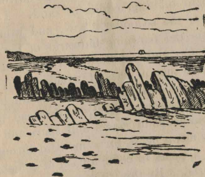
WRECK OF THE SOMERSET.

with saws and axes and shovels, crowbars and wedges. No one among them will go home without some substantial piece of the famous craft, and the especially enterprising individuals will cart off a cord or more of the wood. A similar company was here yesterday and the day before, and a fresh crowd will be here to-morrow and the day after. Enough wood has already been taken to town to make a cane for every inhabitant, and enough iron bolts have been drawn out to make