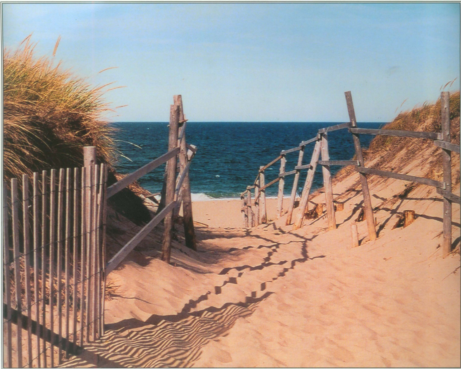
BEACH PASSAGE • Race Point • Provincetown, Massachusetts • Cape Cod National Seashore