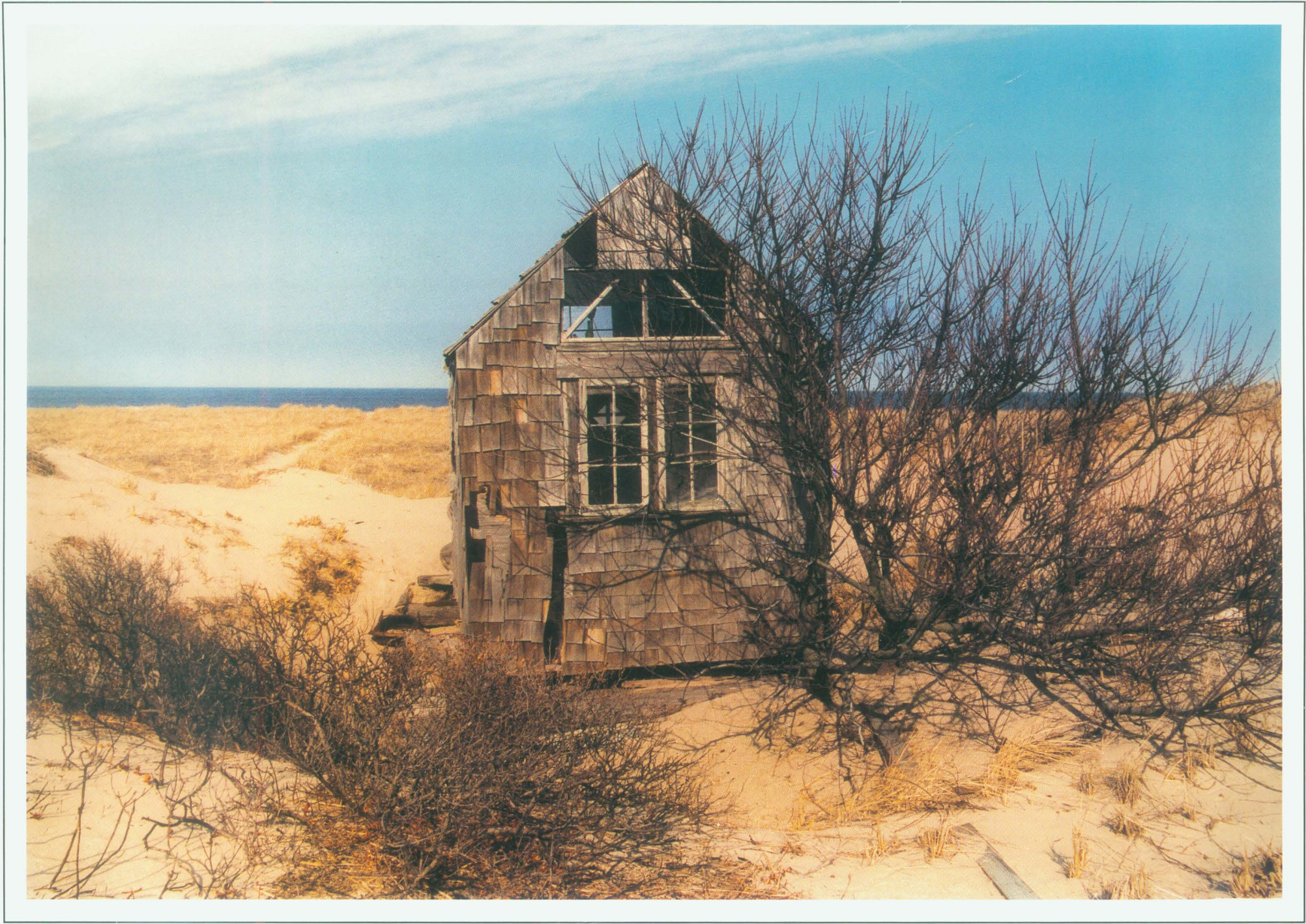
THE DUNE SHACK OF HARRY KEMP, "POET OF THE DUNES" • Provincetown, Massachusetts