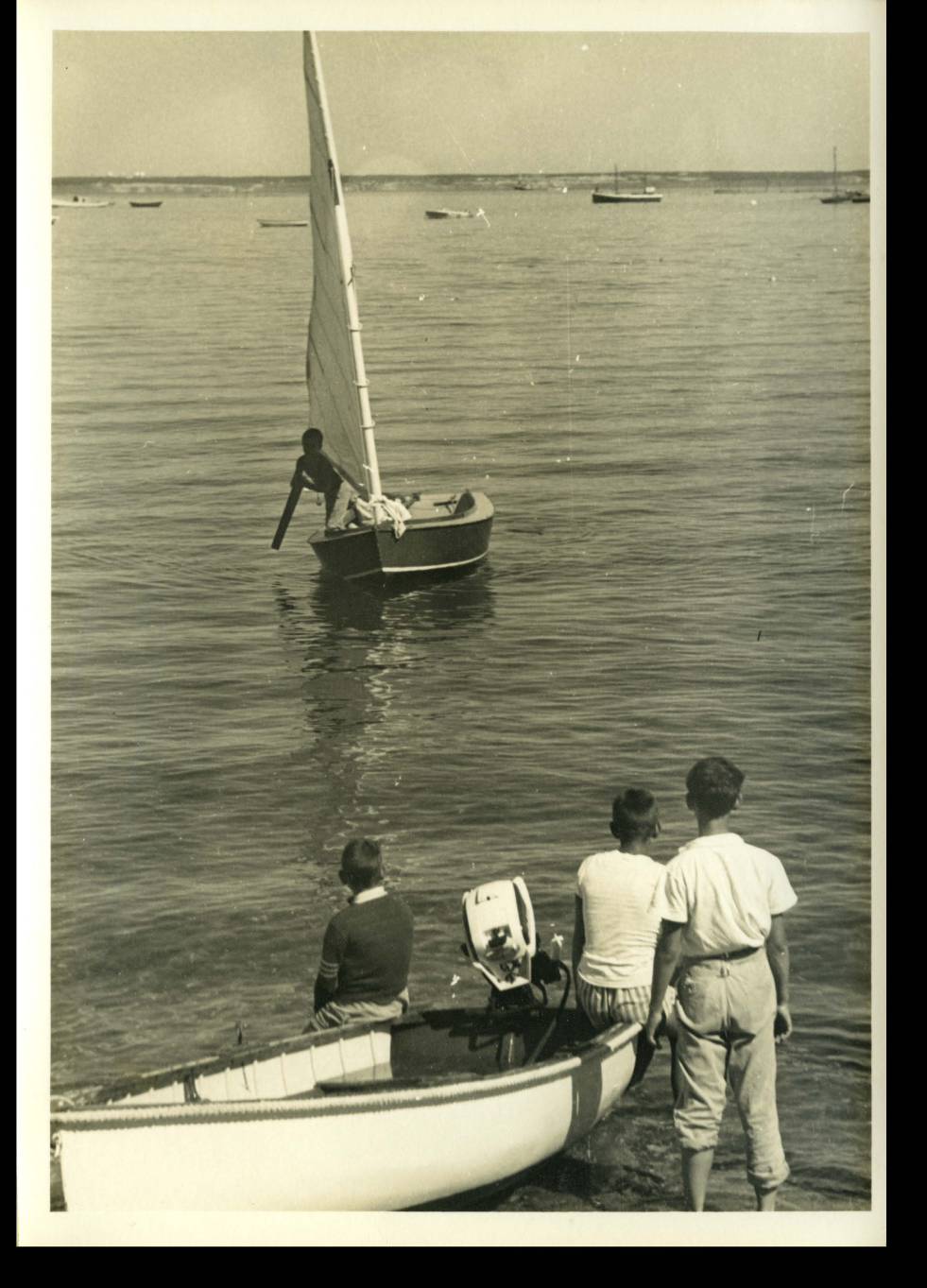
Single-handed skipper heading into the beach