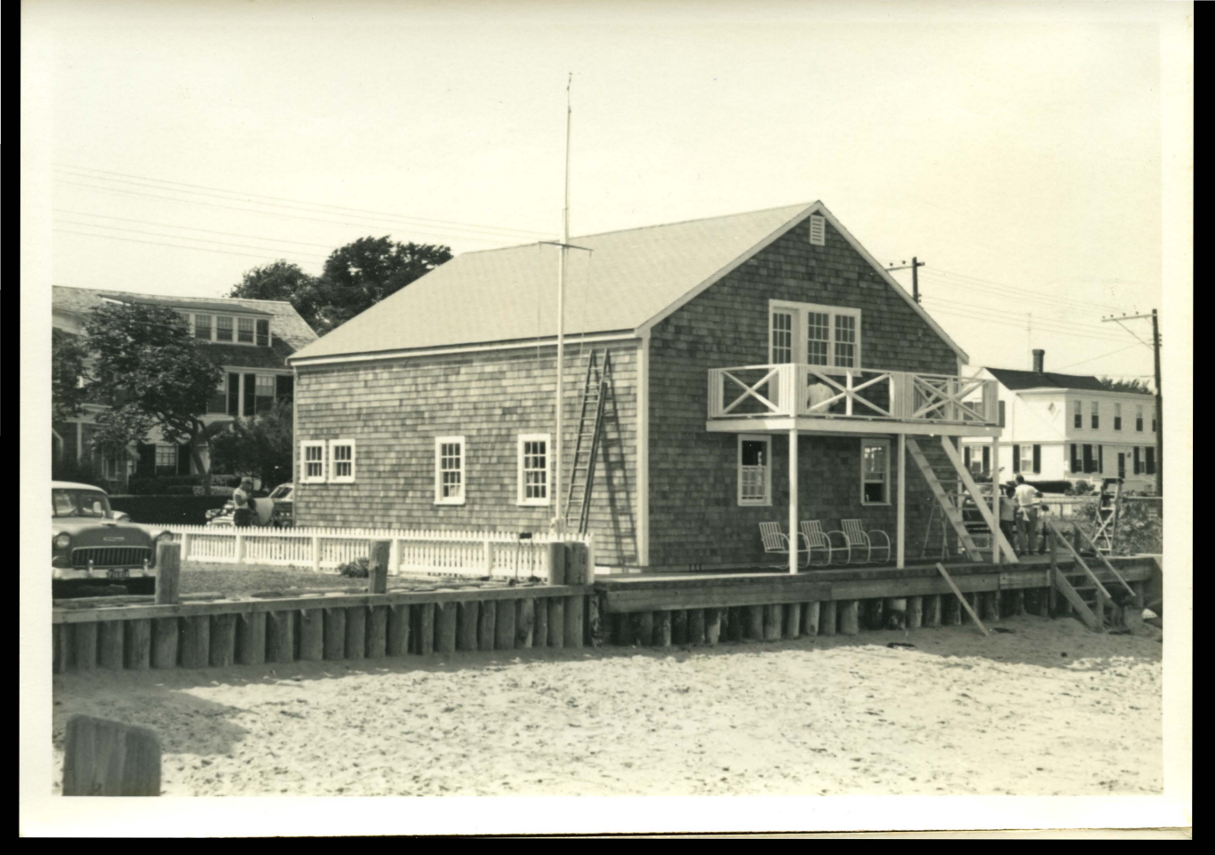
West End Racing Club - 1950's Construction nearly finished