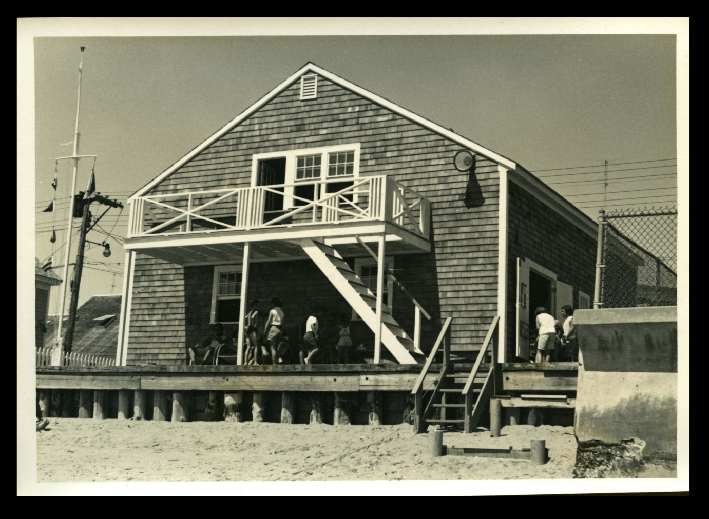
West End Racing Club - first season at 87 Commercial Street