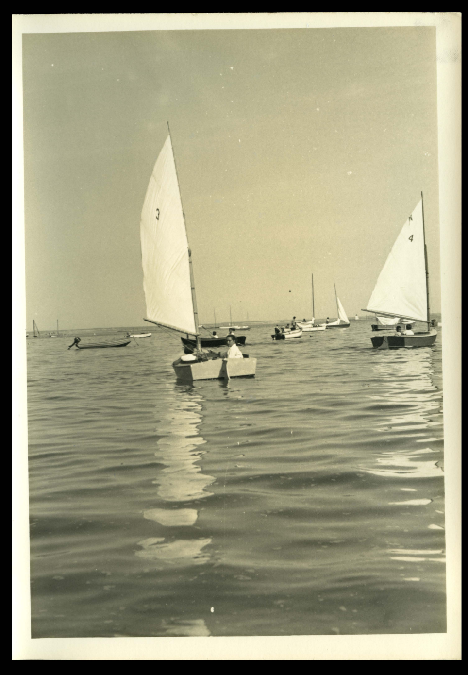
WERC Weasel Races - 1950's