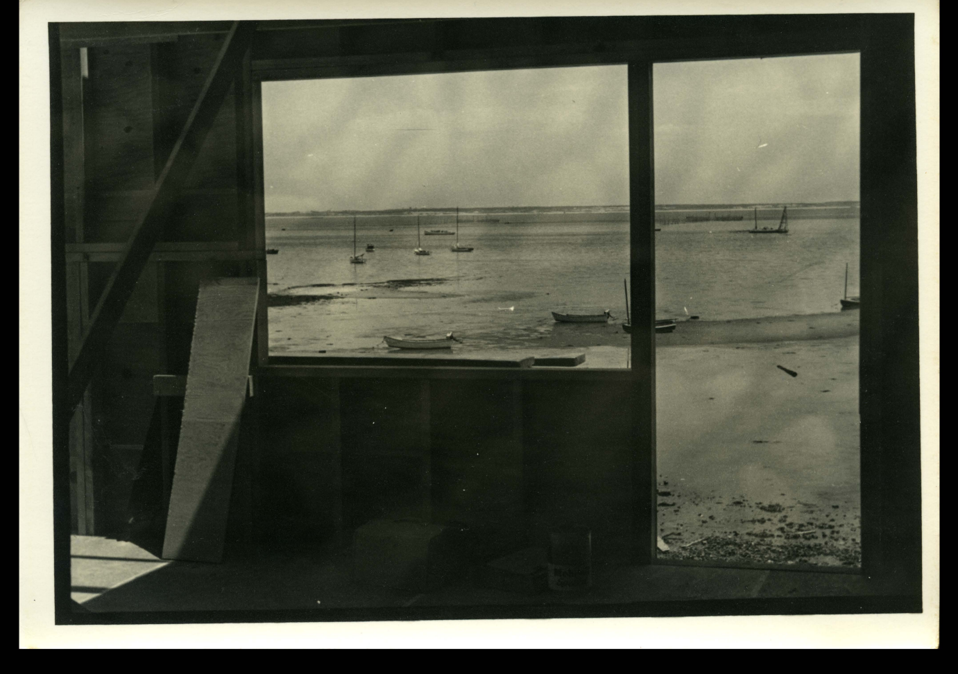
West End Racing Club under construction - 1950's View out the second story door and window Deck is not yet in place