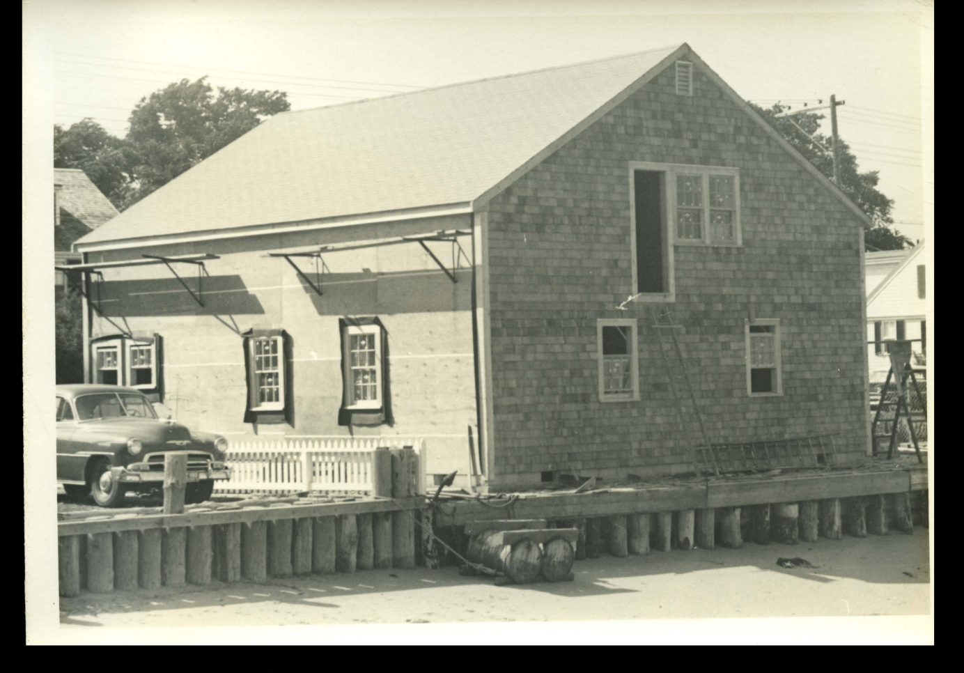
West End Racing Club under construction - 1950's windows are in, roof is on