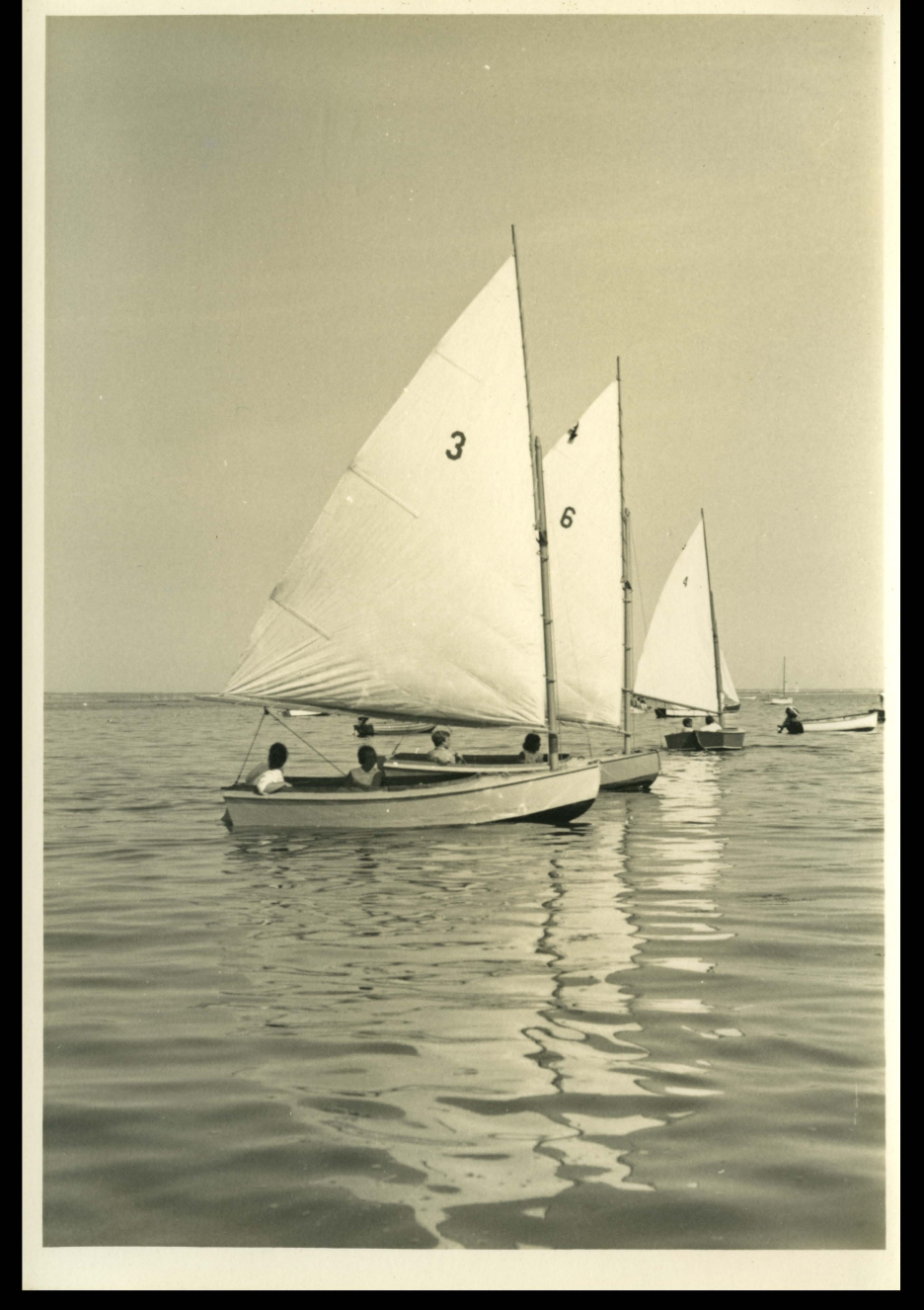
WERC Weasel Fleet - 1950's