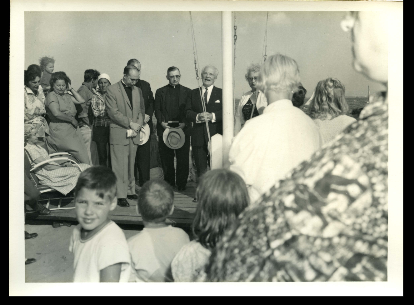
Dedication of the West End Racing Club