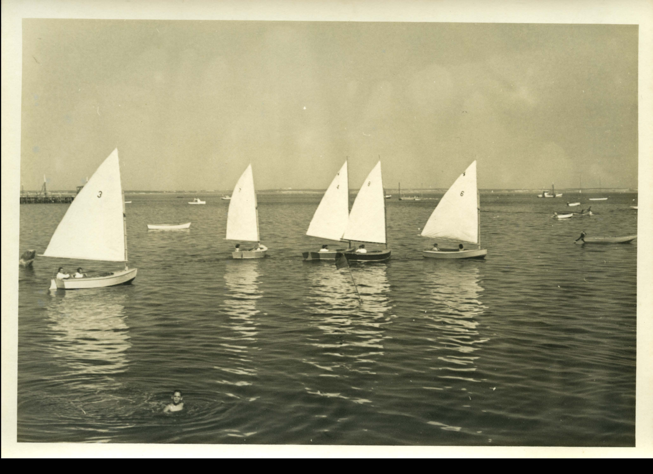
West End Racing Club Weasel fleet in the 1950's - built by fathers of club members - very stable flat-bottomed, gaff-rigged, center board sailboat