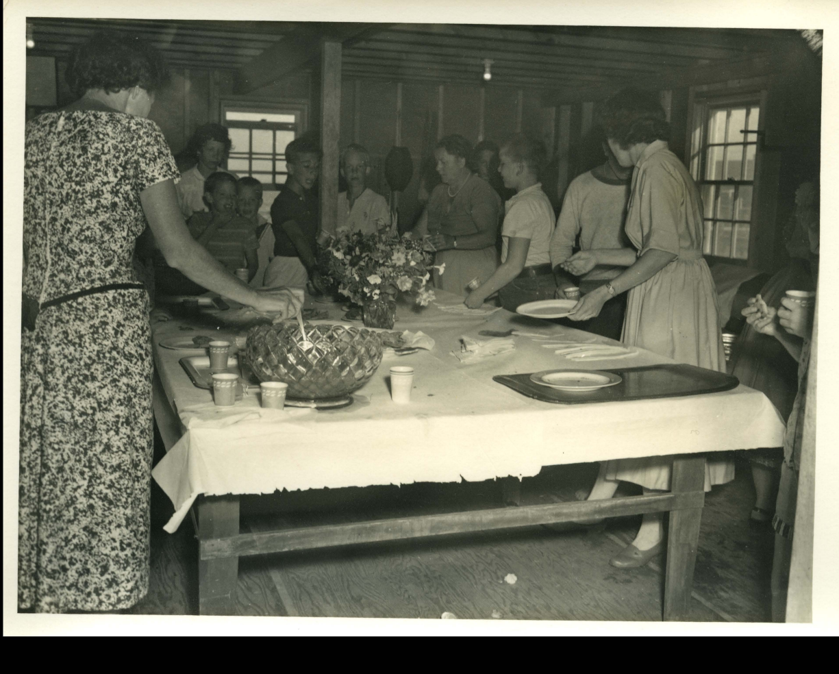
End of the season buffet dinner and awards ceremony