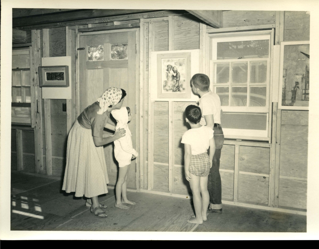
Children viewing donated paintings to be raffled off to benefit the West End Racing Club