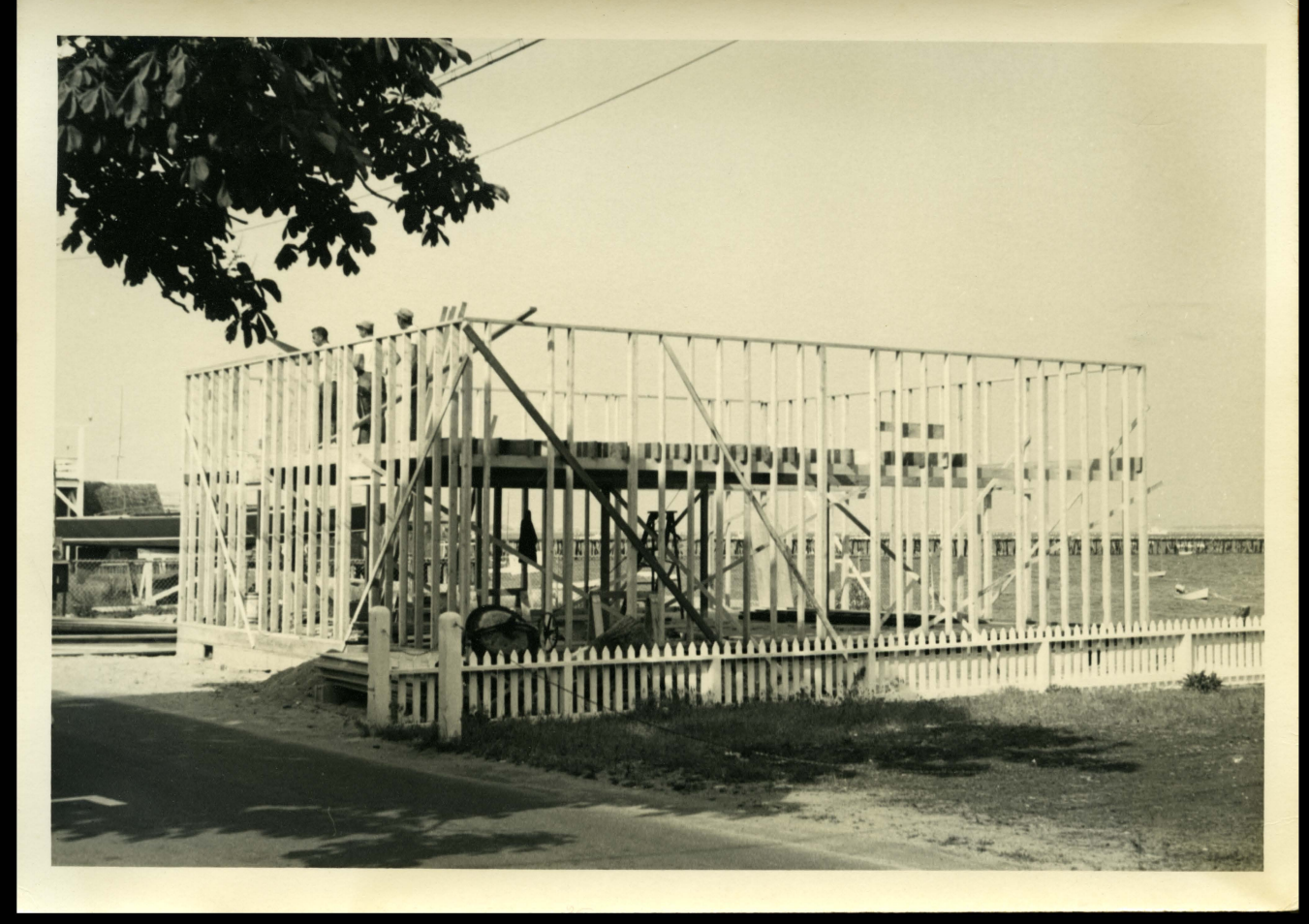
Construction has begun on the club house for the West End Racing Club - 83 Commercial Street 1950's