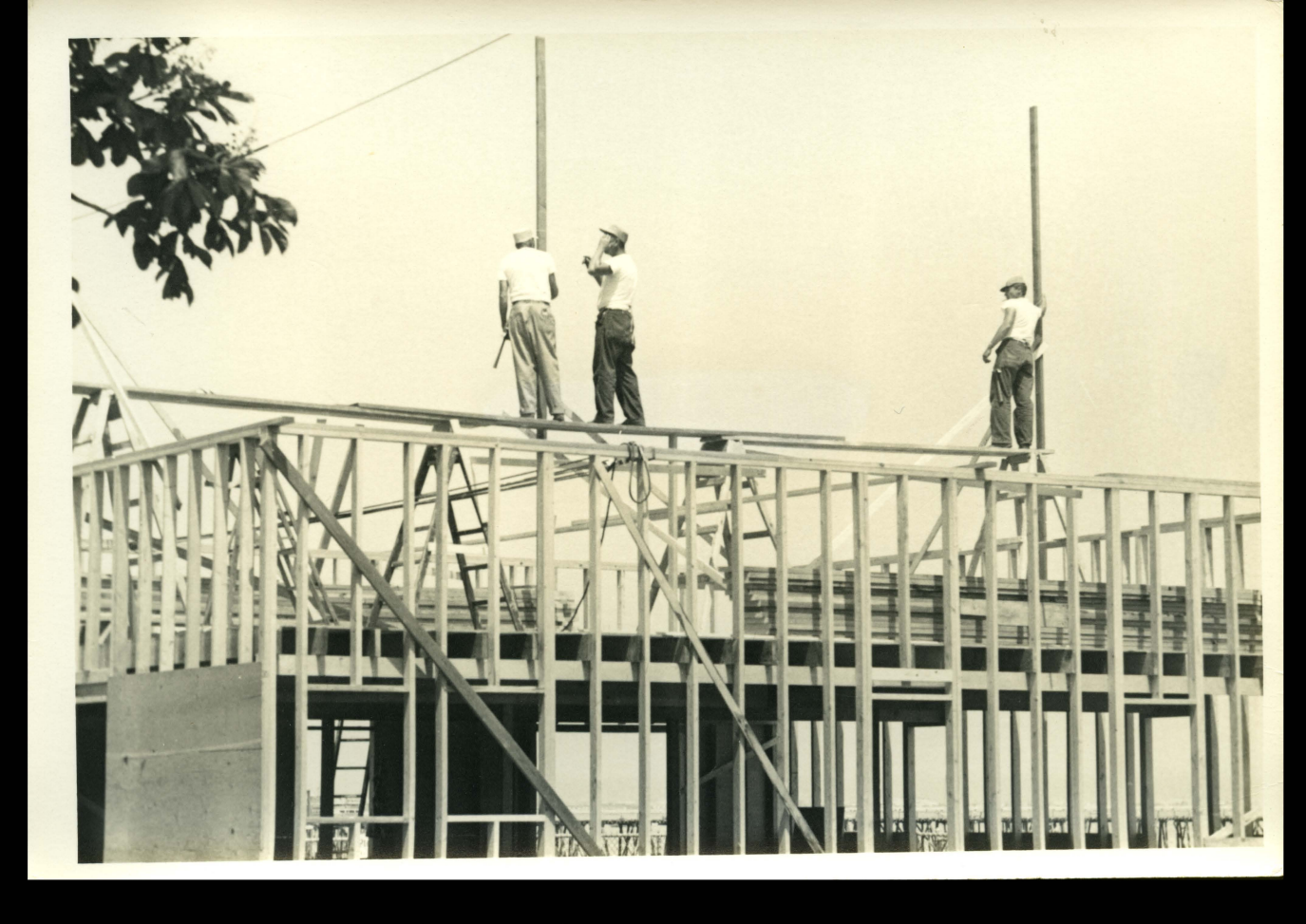
Getting ready to raise the roof of the West End Racing Club