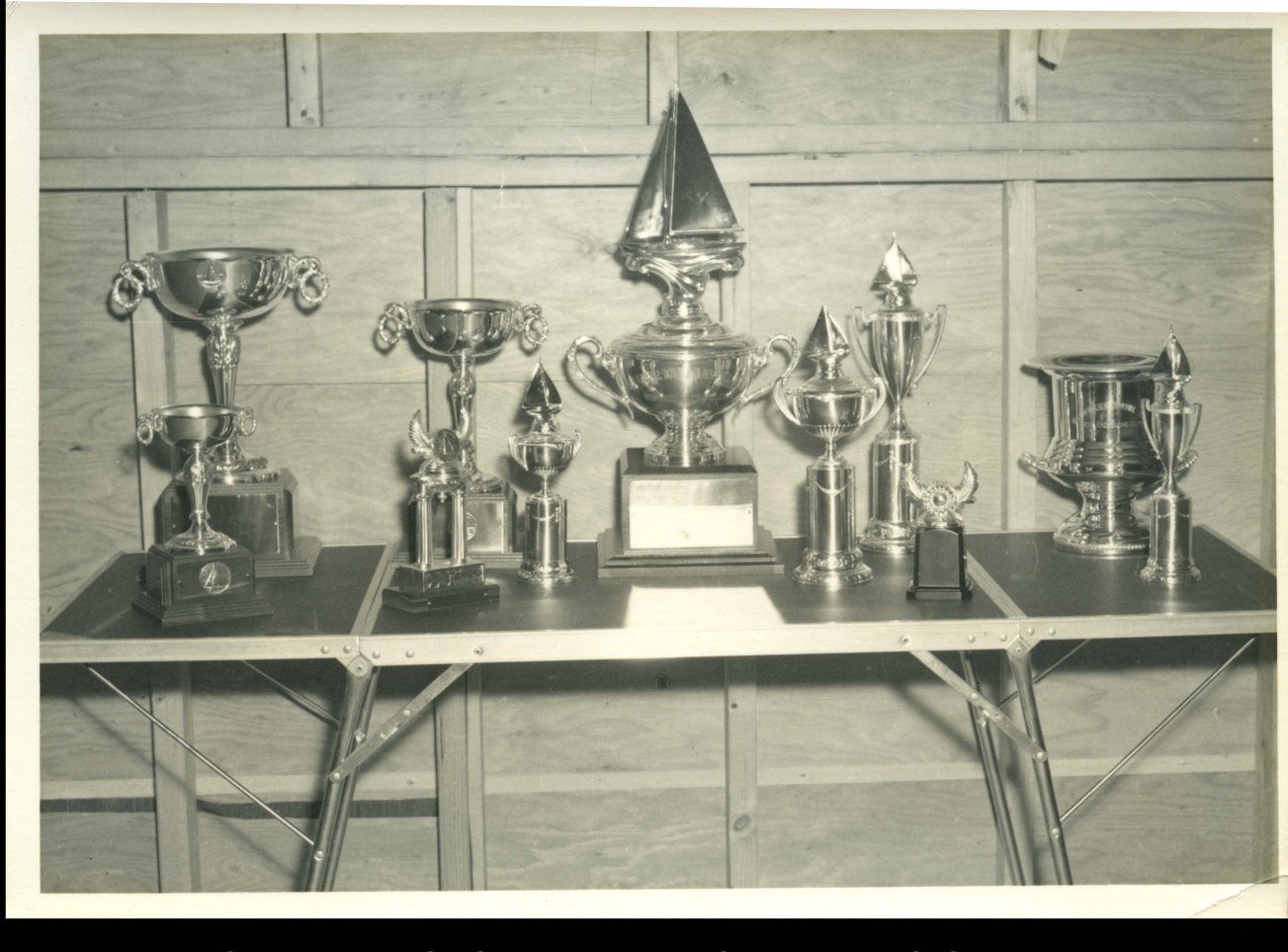
Trophies awarded to West End Racing Club winning members at the end of the season