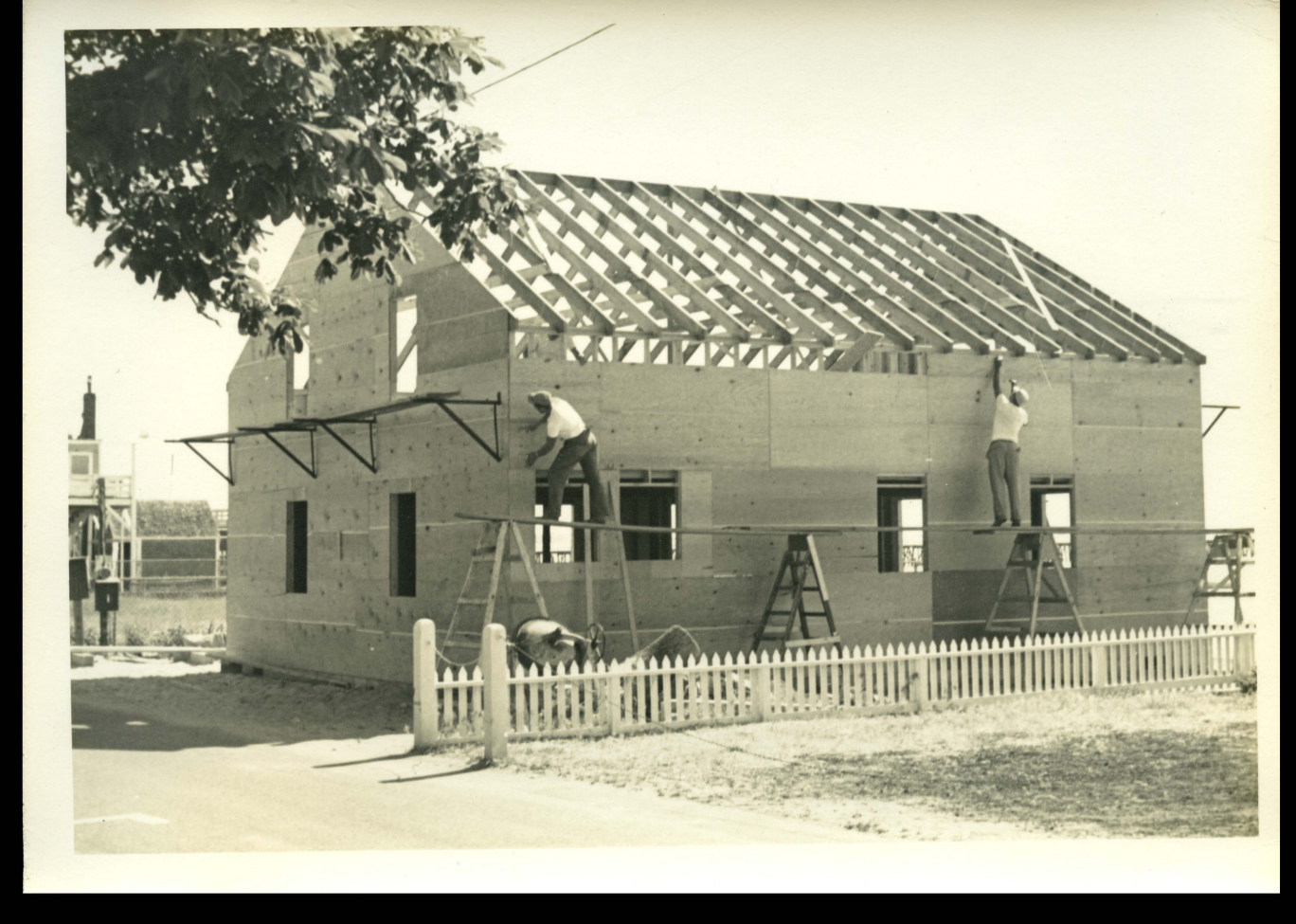
Roof rafters in place on the West End Racing Club - 1950's