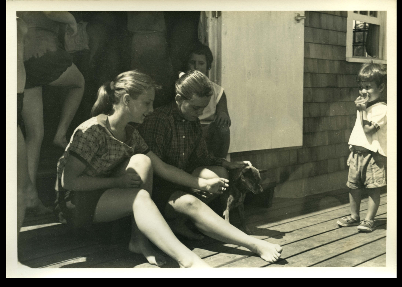
Kids sitting in the east side doorway at the West End Racing Club