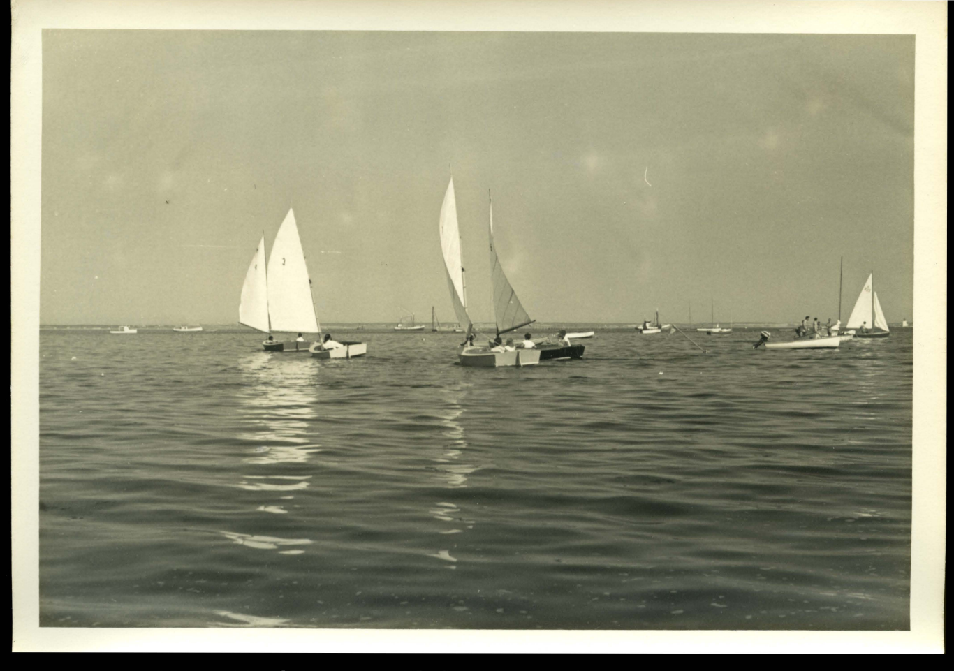
West End Racing Club - Weasel races - 1950's