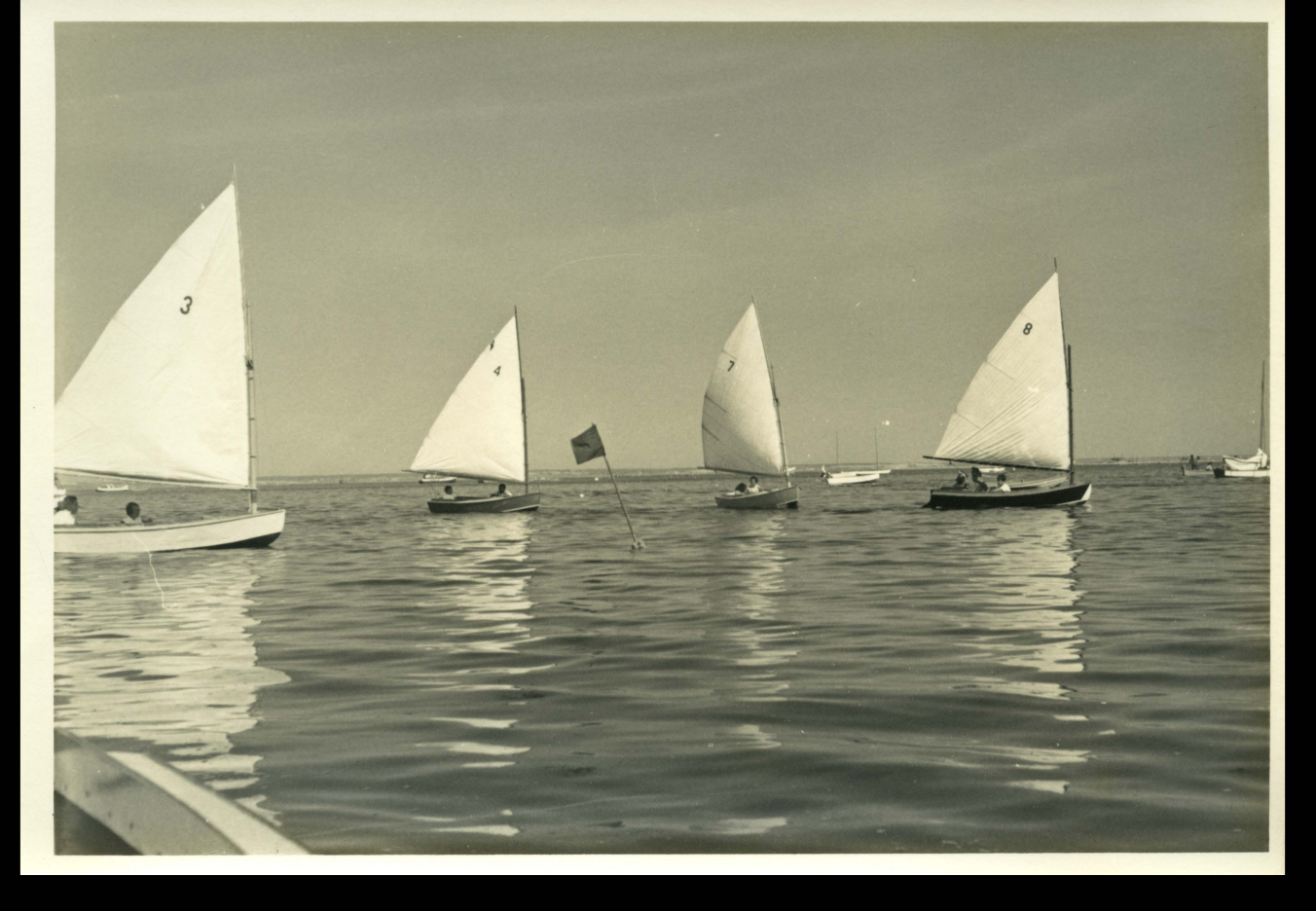
West End Racing Club Weasel fleet races - 1950's