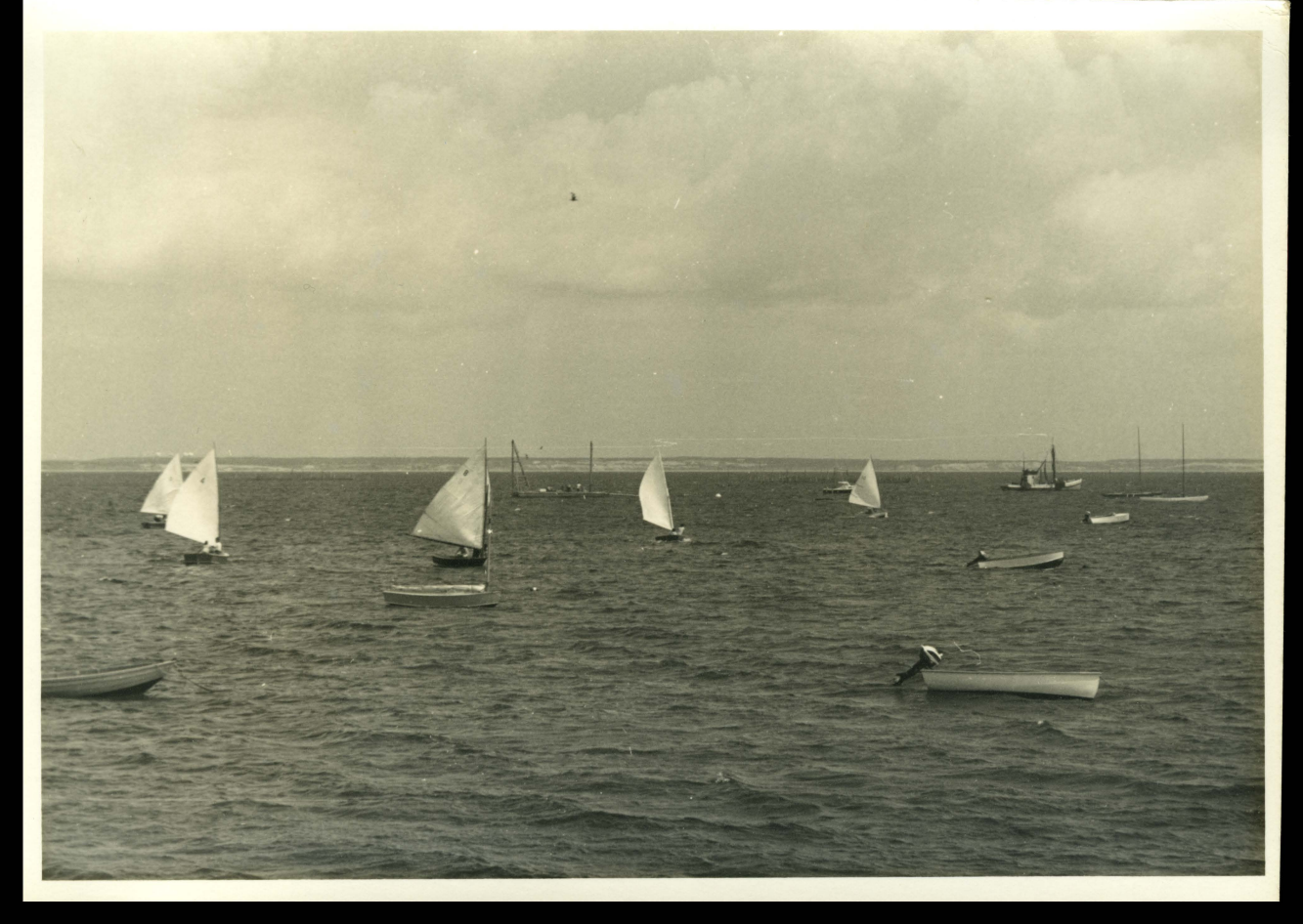
West End Racing Club Weasel fleet race Center rear - skow with poles for repairing the weir traps Right rear - fishing dragger and two 210's - doubled-ended racing sloops owned and raced by Larry Richmond and William Hurlbert