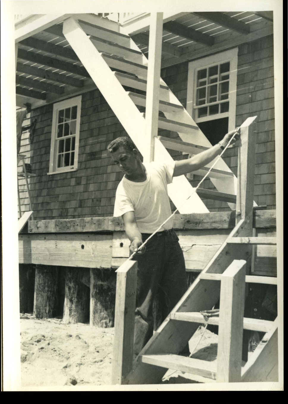
West End Racing Club - railing for beach stairs