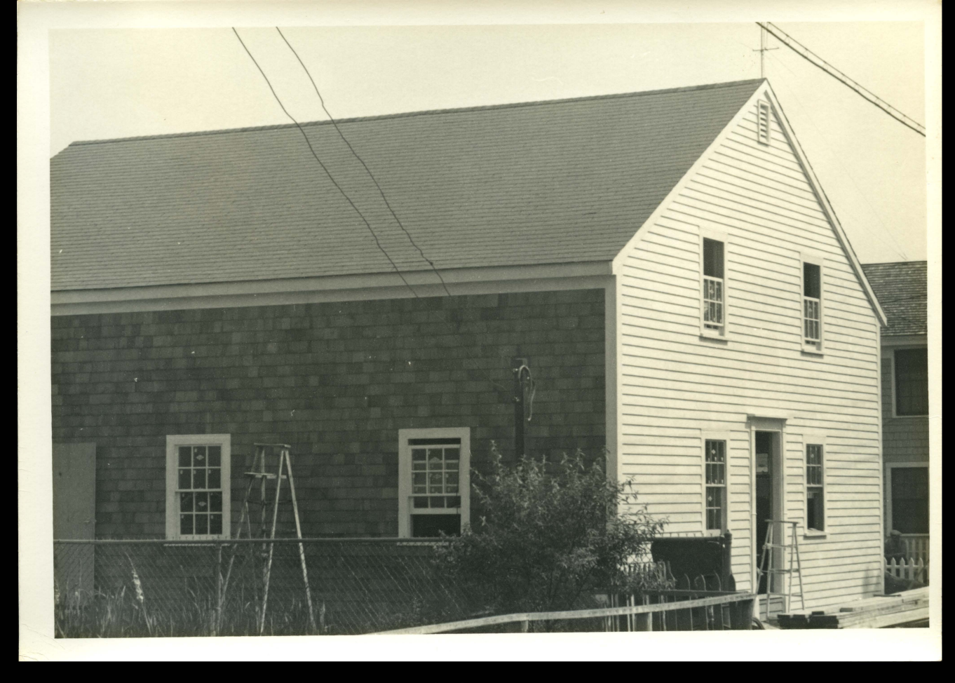
West End Racing Club - 83 Commercial Street construction is nearly finished - 1950's