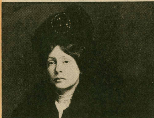
Photos from family albums of the original Provincetown Players show George Cram Cook, upper left, and his wife, playwright Susan Glaspell, top right; Hutchins Hapgood, left center, and his wife, Neith Boyce, lower left; and Joe O'Brien and his wife, Mary Heaton Vorse, lower right. The photo of Eugene O'Neill and Agnes Boulton at the top of the page is also from a family album.