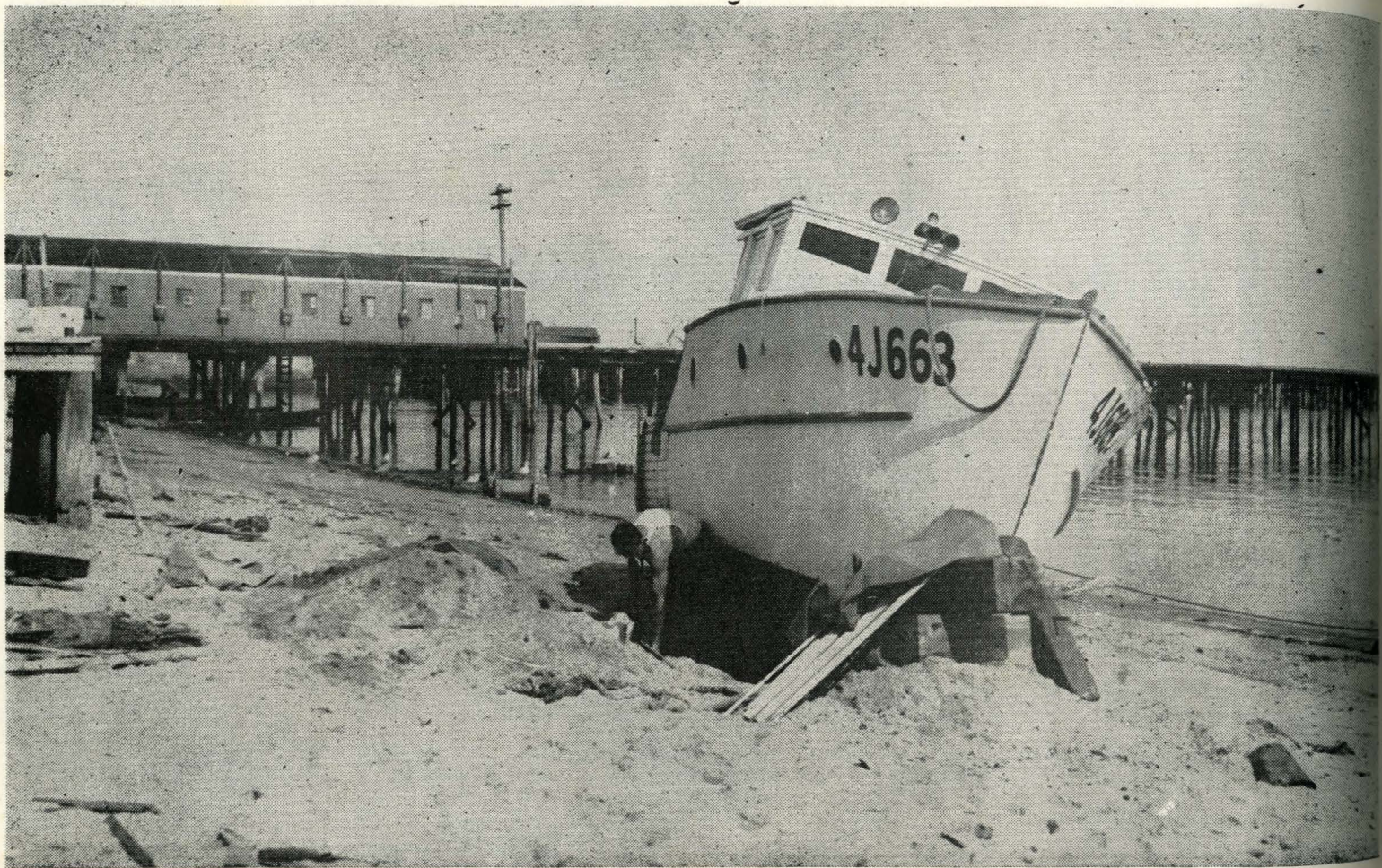
NEW BEDFORD lobster boat broke from its mooring in Provincetown harbor when hit by drifting dragger and grounded.