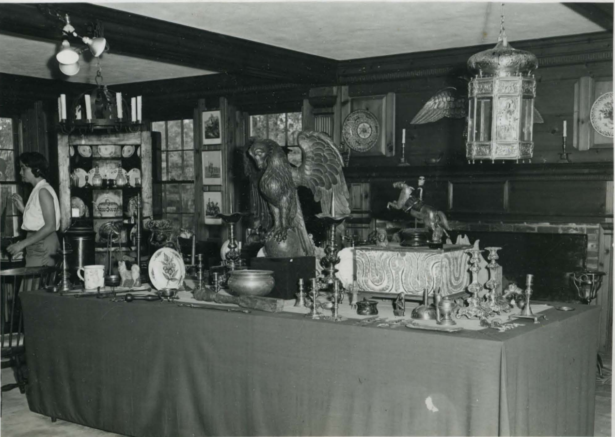
Antiques on Cape Cod, July 1958.