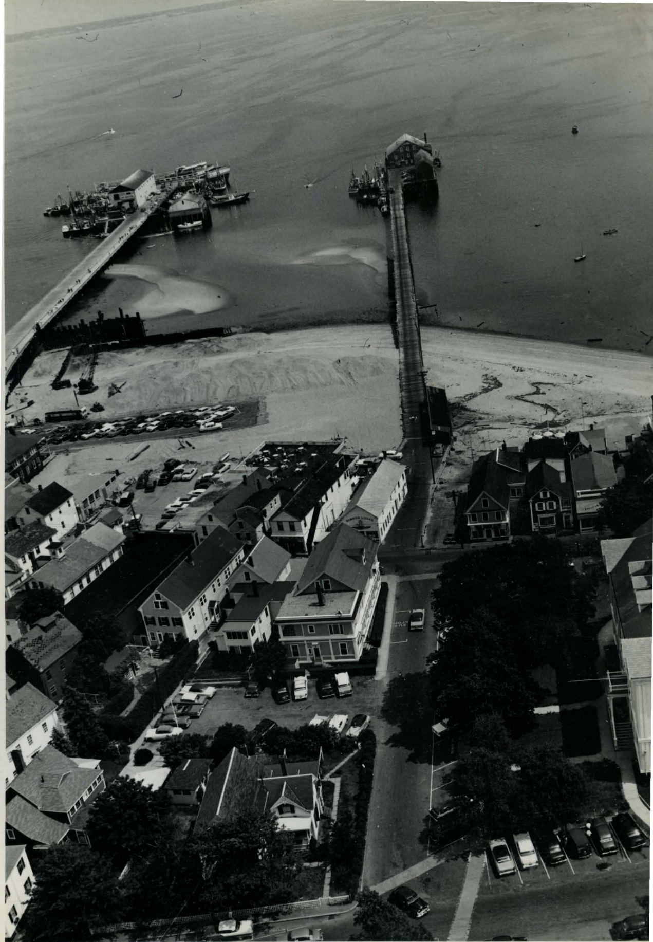
Provincetown, Cape Cod, Mass. from the top of the Monument 195