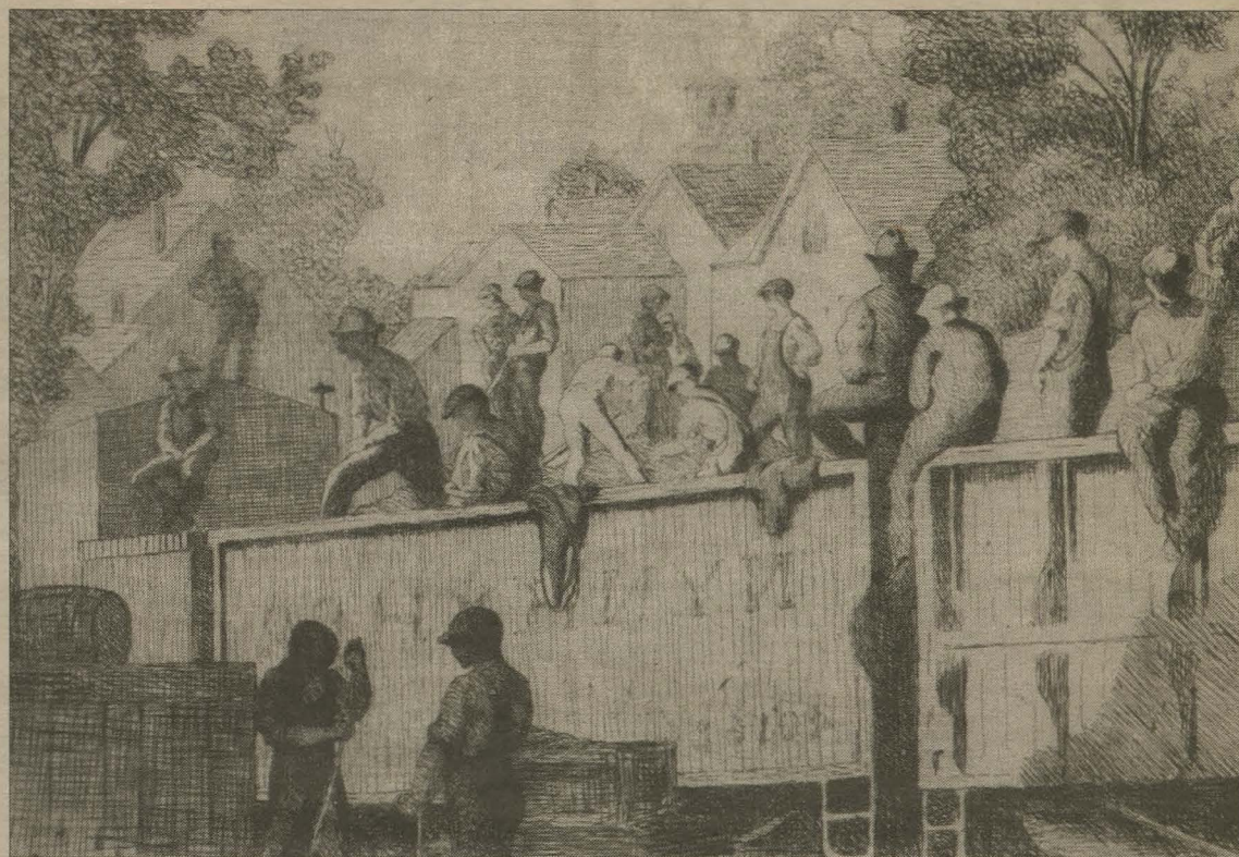
"The Rail Road Yard," painted in Provincetown in approximately 1920.