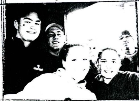
Provincetown High School Volunteers

house@attbi.com. After your first stay here you may be back for work weeks!