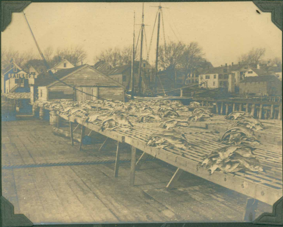
Drying fish fish slabs.