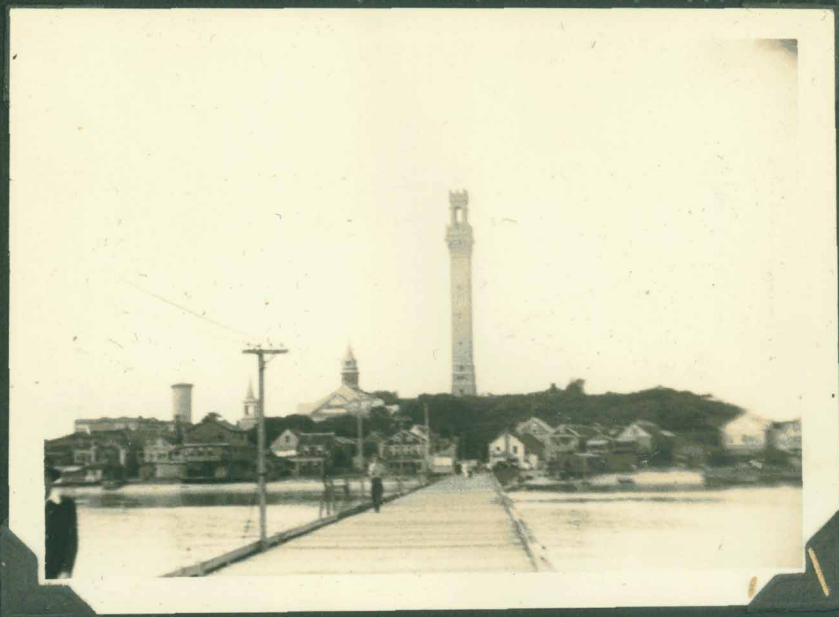
Provincetown, Monument from the end of Railroad Wharf

TOWN HALL, PILGRIM MEMORIAL ↓ ↓ MONUMENT.