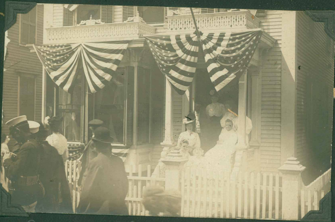
Aug 23-07. Decorated to celebrate the Dedication of the Pilgrim Memorial Monument. (A big day for Provincetown)