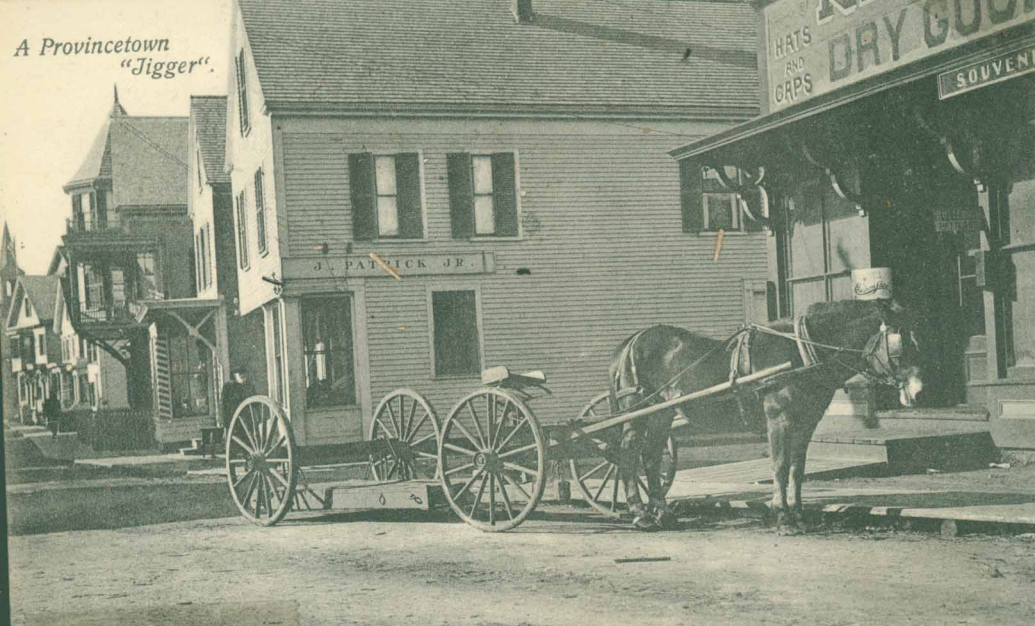
A Provincetown "Jigger".