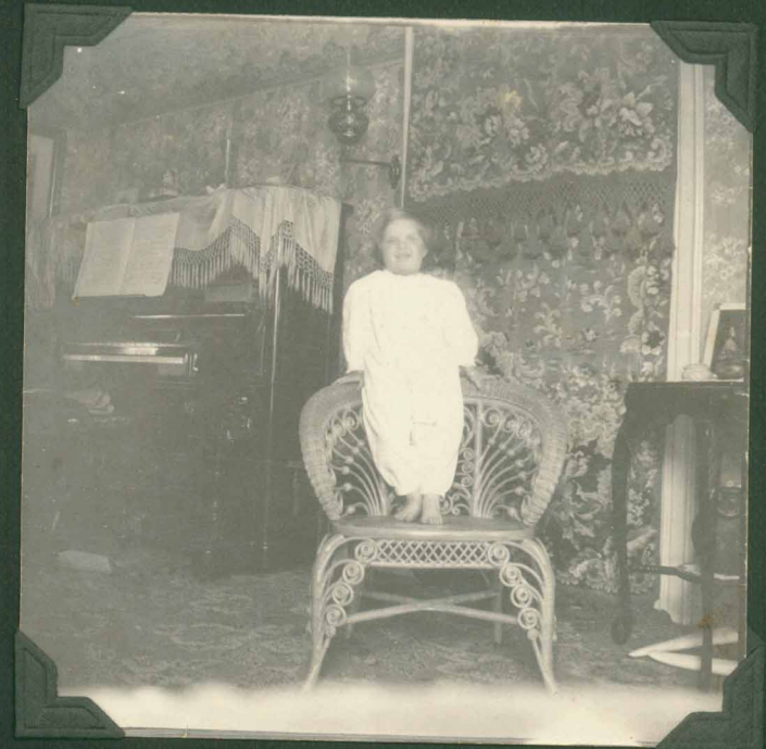
Ready for bed.