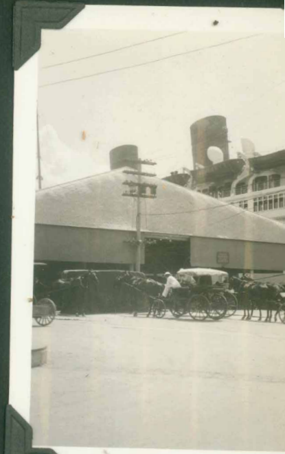
Carrie on the deck of the Monarch of Bermuda, on the voyage to Bermuda, Summer, 1936.