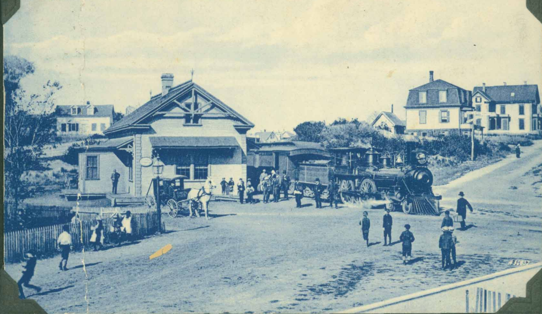
403 - 2 E R. R. Station, Provincetown, Mass.