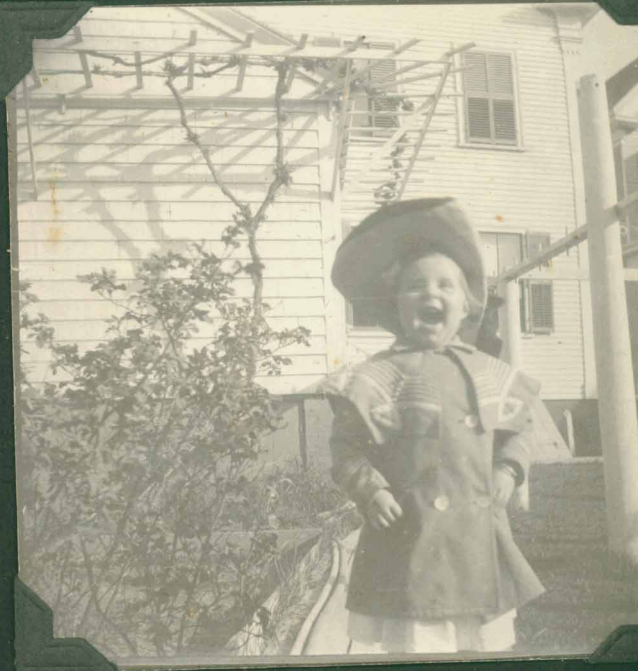
Dressed up in mother's hat.