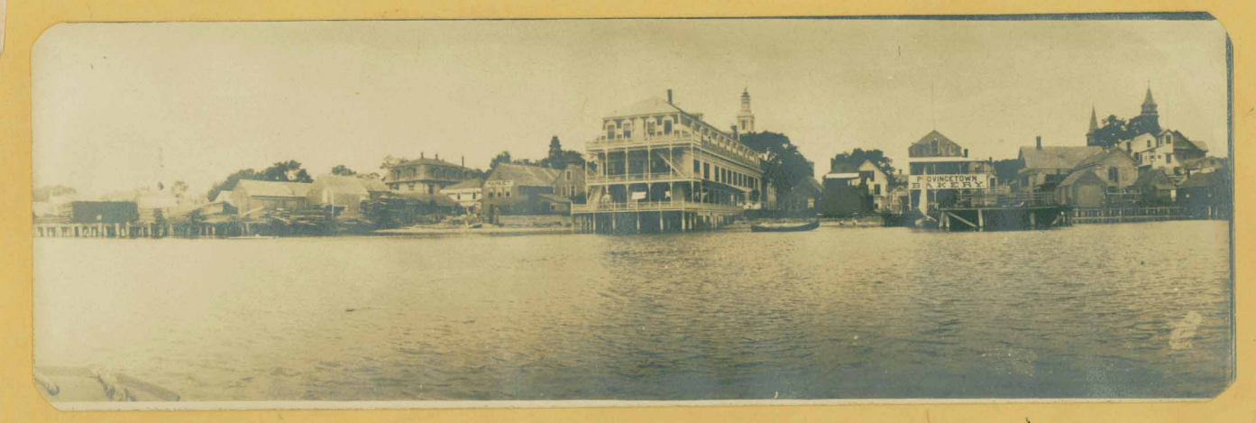
Central House, center. Centenary Church left. Lancy House, cupola beside Central House. Christopher Wren Church next, with the Pilgrim Congregational Church & Town Hall spires, right.