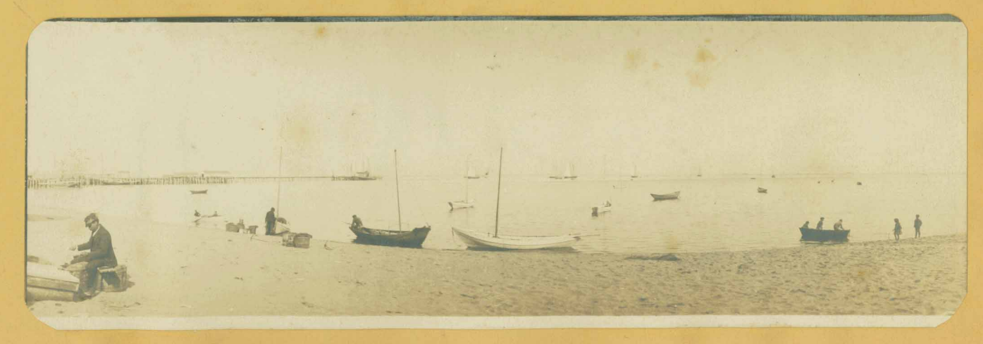
From Behind Central House - Railroad Wharf in the distance.