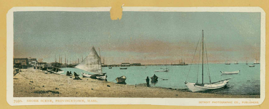
Same scene - colored.