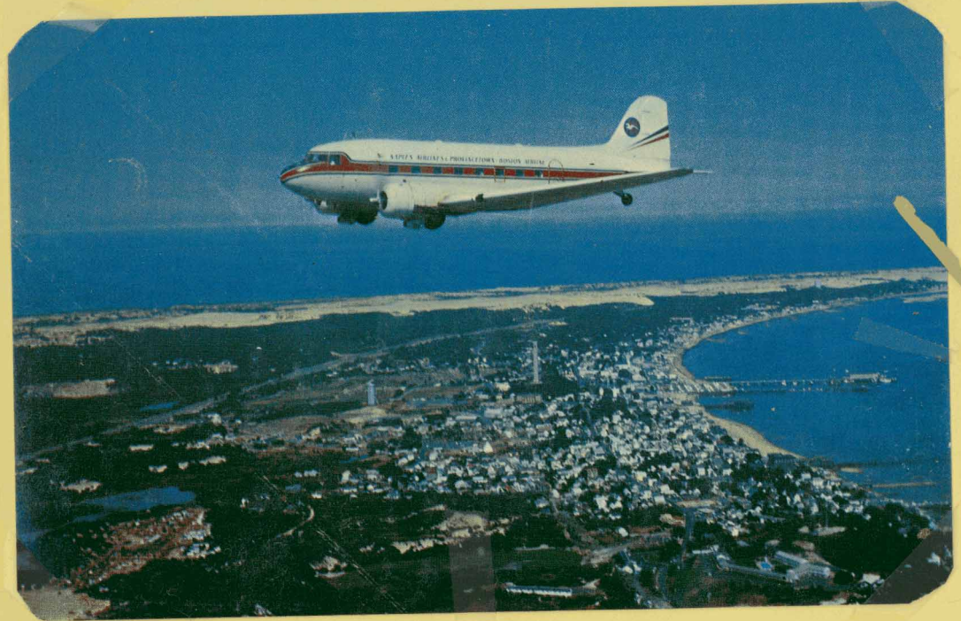
A DC-3 operating between Provincetown, Naples and Miami - 1976