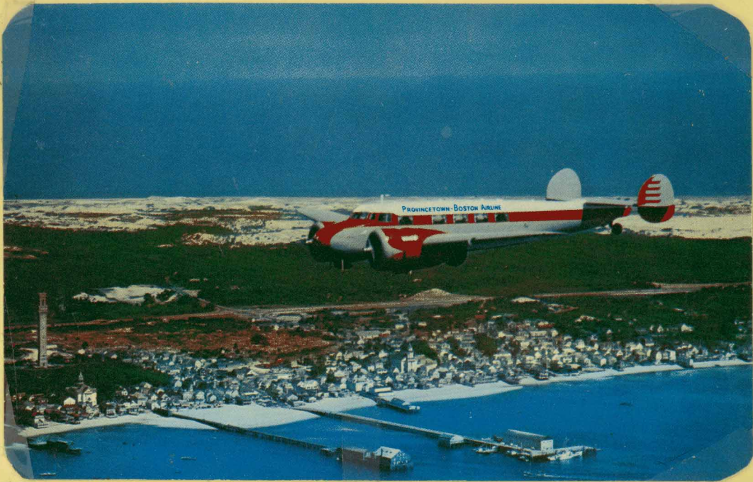
A Lockheed-10 of the Airport - - - 1976