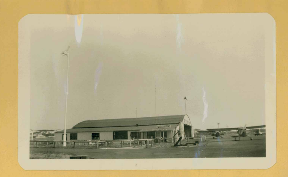
And here is the west side of the hangar, showing the office. September 1952