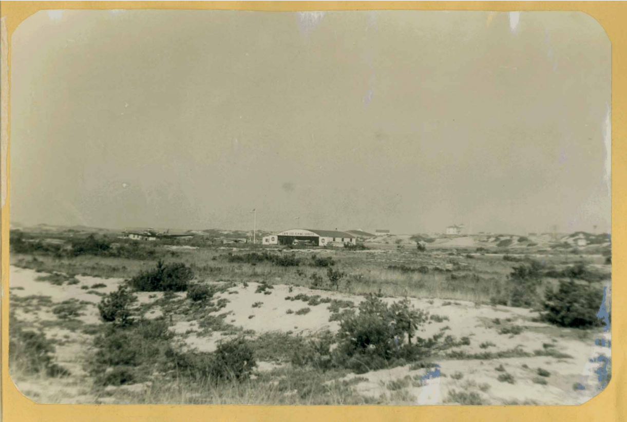
Our new hangar - Picture taken September 1952 Notice the visiting four-motor plane, and Race Coast Guard Station, right.