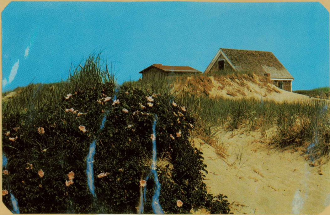
SHACK ON THE DUNES WITH WILD ROSES Cape Cod, Massachusetts (To right of Parking Area) - 1957 -