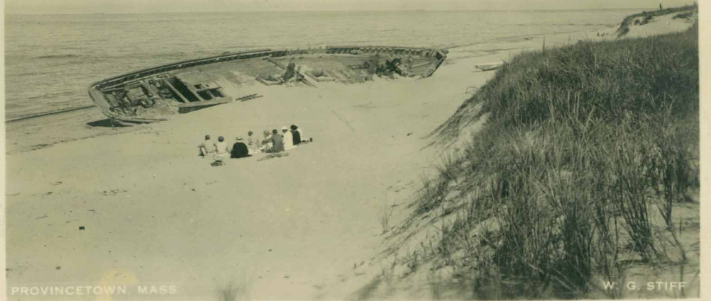
Remains of the Annie L. Spindler - About 1935. The masts were taken off by one of the cold storages in town and used for repairing their wharf.