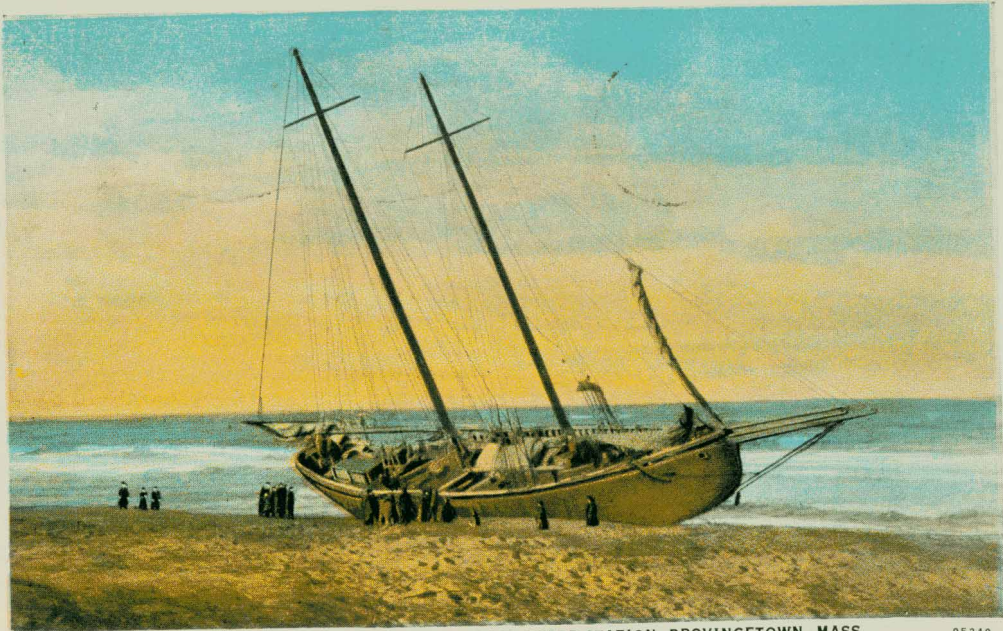
179. "RUM RUNNER" WRECKED AT RACE POINT COAST GUARD STATION, PROVINCETOWN, MASS. 95249