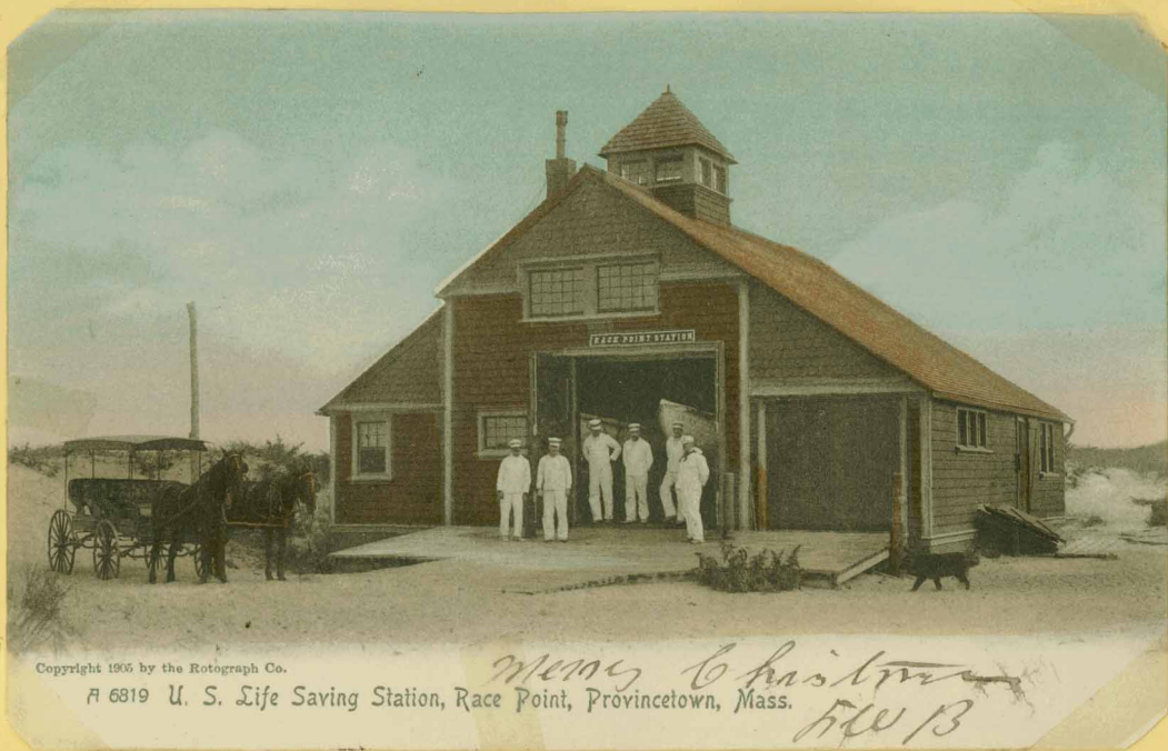
The Old Life Saving Station - - 1905