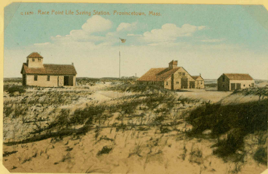
The Old Station - 1907

December 3, 1883: The schooner Oliver Ames, of Taunton, bound from Gardiner, Maine, to Richmond, Virginia, with a cargo of ice, and having a crew of seven, stranded at half past two in the morning off Race Point Station, within a few hundred yards of the station. The weather was very tempestuous, the wind being fresh from the northward, with frequent snow squalls. The night also was extremely dark and the seas high and dangerous. The schooner was sighted by the westerly patrol from the station a few moments before she struck, but his signal flare was of no avail, as she fetched up on the bar while his signal flare was still burning. He hurried to the station and reported, and in a few minutes the lifesaving crew were out with their surf-boat. On attempting to launch in the heavy surf, the boat was thrown back on the beach full of water. Not discomfited by this the boat was quickly bailed out and a second attempt was made, but with the same result. The third time the lifesaving crew got well afloat, but as they were beginning to fancy themselves all right a heavy comber