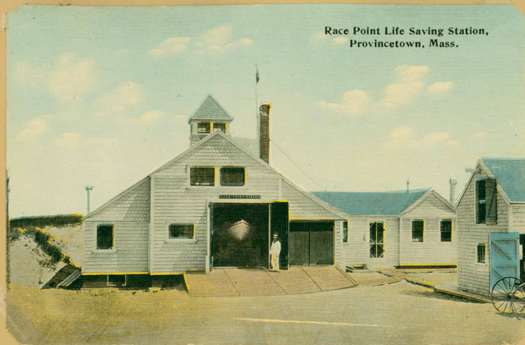
- 1910 -