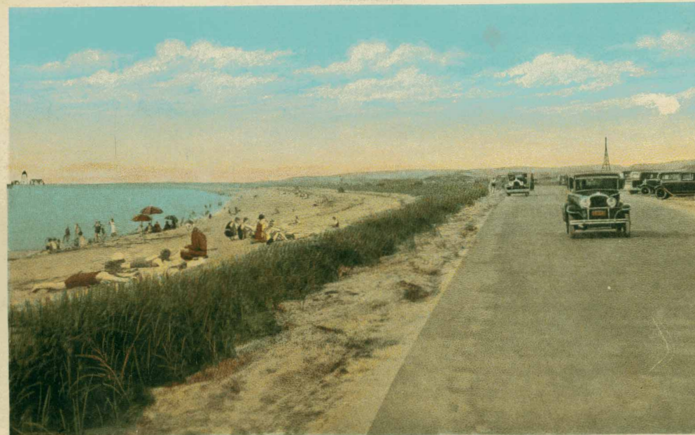
103 THE NEW STATE ROAD ALONG THE BEACH, PROVINCETOWN, CAPE COD, MASS.