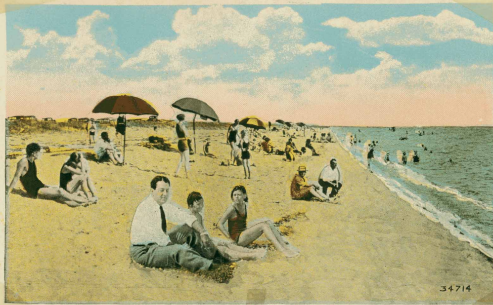
Provincetown Beach on the Dunes Road, Cape Cod, Mass.