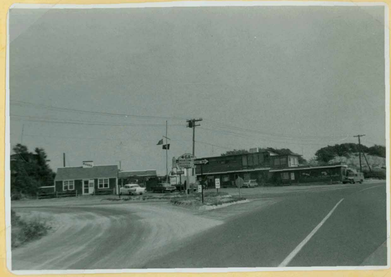
The Moors after Rebuilding - Sept. 12, 1961 Also the beginning of Back Street, (Bradford Street) - left

Provincetown in three weeks. In the other fire, $500,000 damage was counted after flames swept the Murchison estate and art galleries. An unidentified housewife discovered today's fire. Firefighters were unable to save the recently renovated restaurant. A new liquor supply was consumed by the flames.