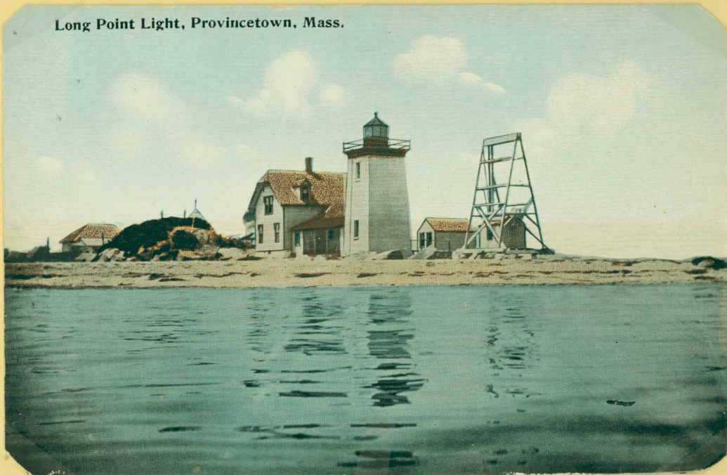
Long Point Light, Provincetown, Mass.