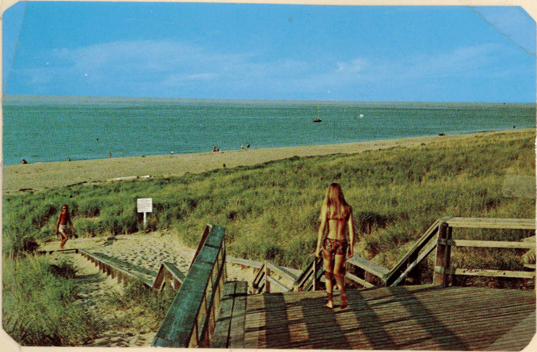
New Steps down to the Beach - 1972