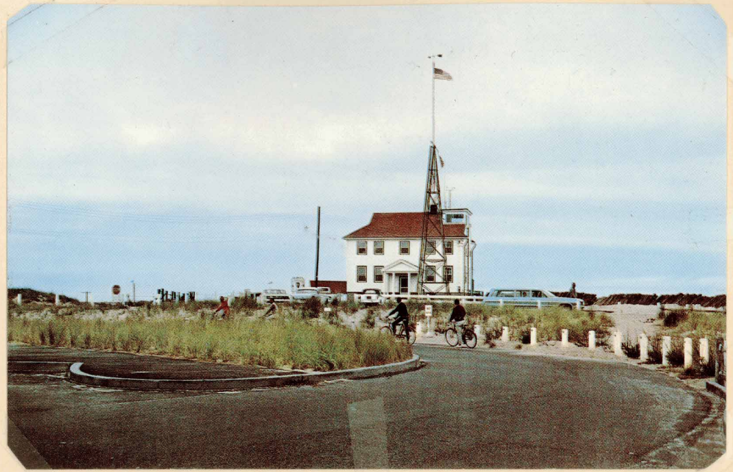
Race Point Coast Guard Station - 1972