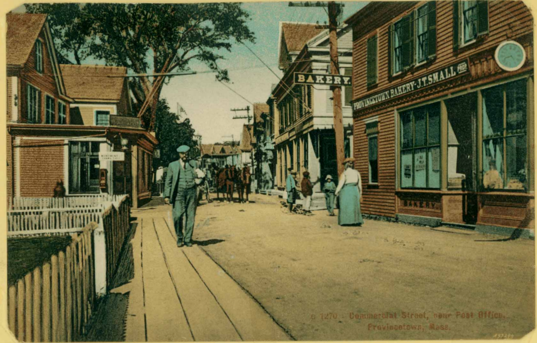
© 1270 - Commercial Street, near Post Office, Provincetown, Mass.