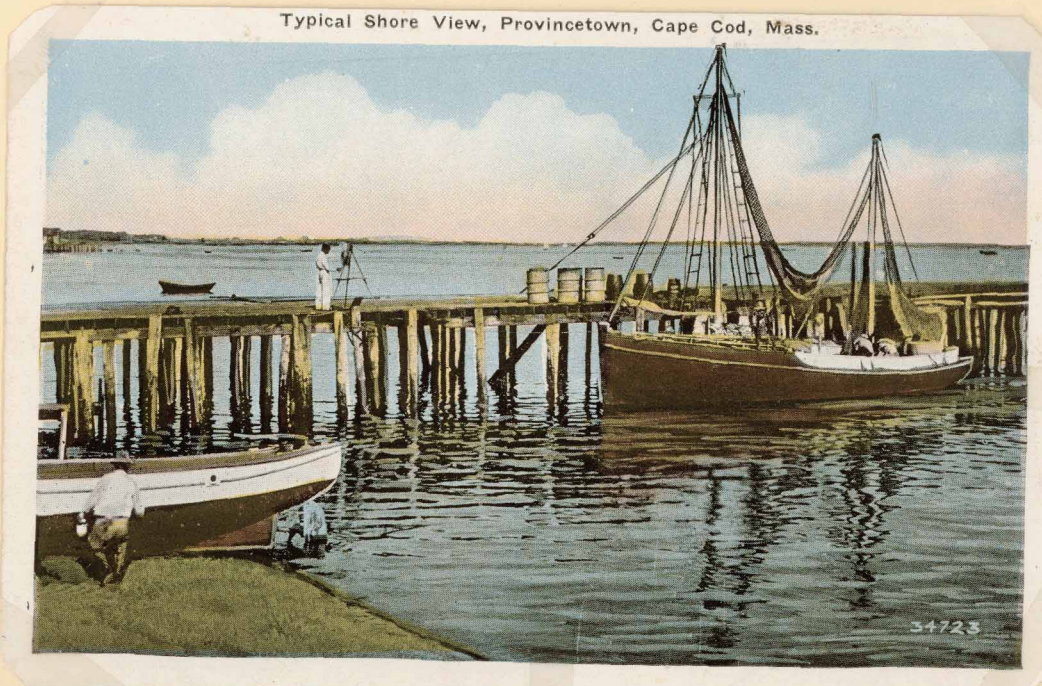
Hilliards Wharf (Now Macara's) with an artist - 1935