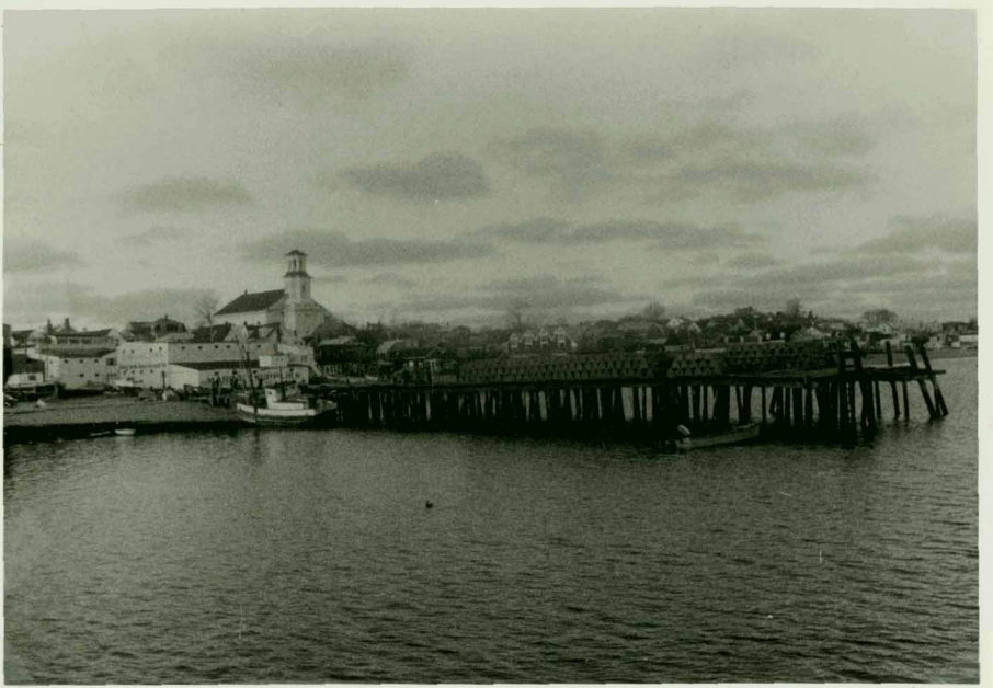
The Center Methodist Church and the J.D. Hilliard Wharf from Railroad Wharf -