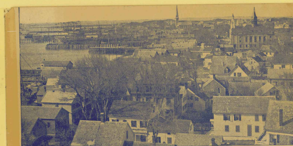
Looking west from belfry of Center M. E. Church. Souvenir of Provincetown, Mass. First Landing Place of the Pilgrims, Nov. 11, 1620, o.s.