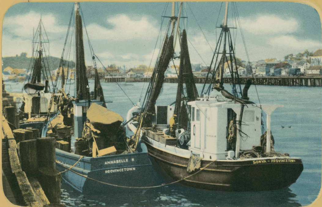
Tied up at Sklaroff's Wharf - - 1955