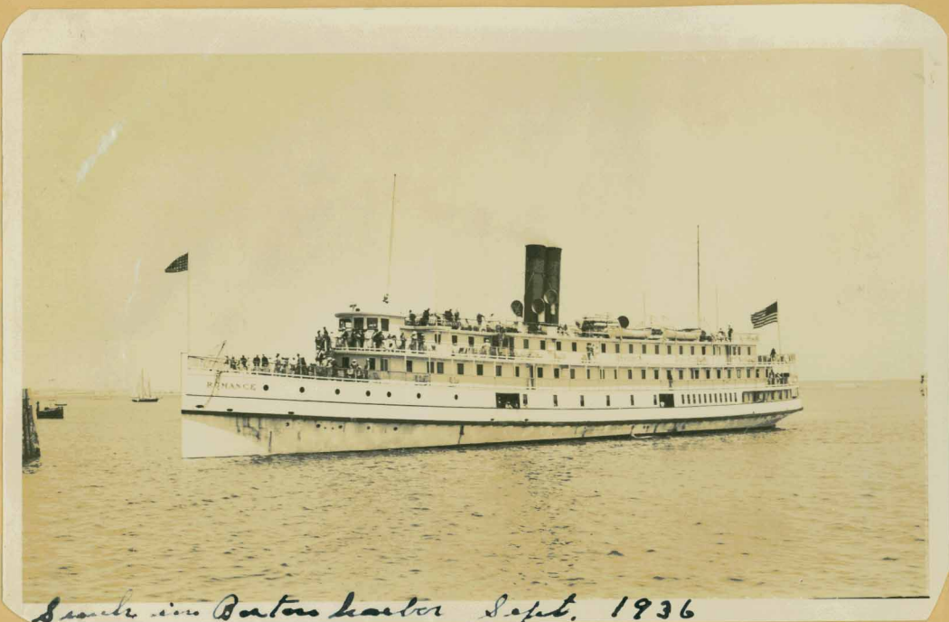
Sailed in Boston harbor Sept. 1936