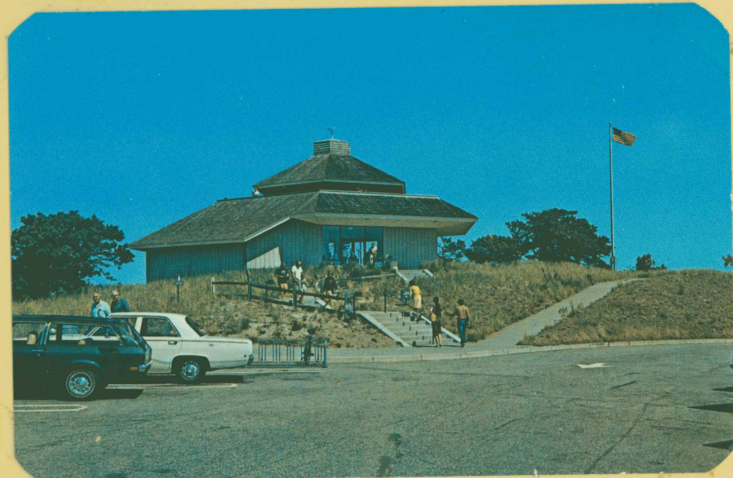
The new Visitors Center where the wooden observa- tion platform was (preceding Page ) .... 1975