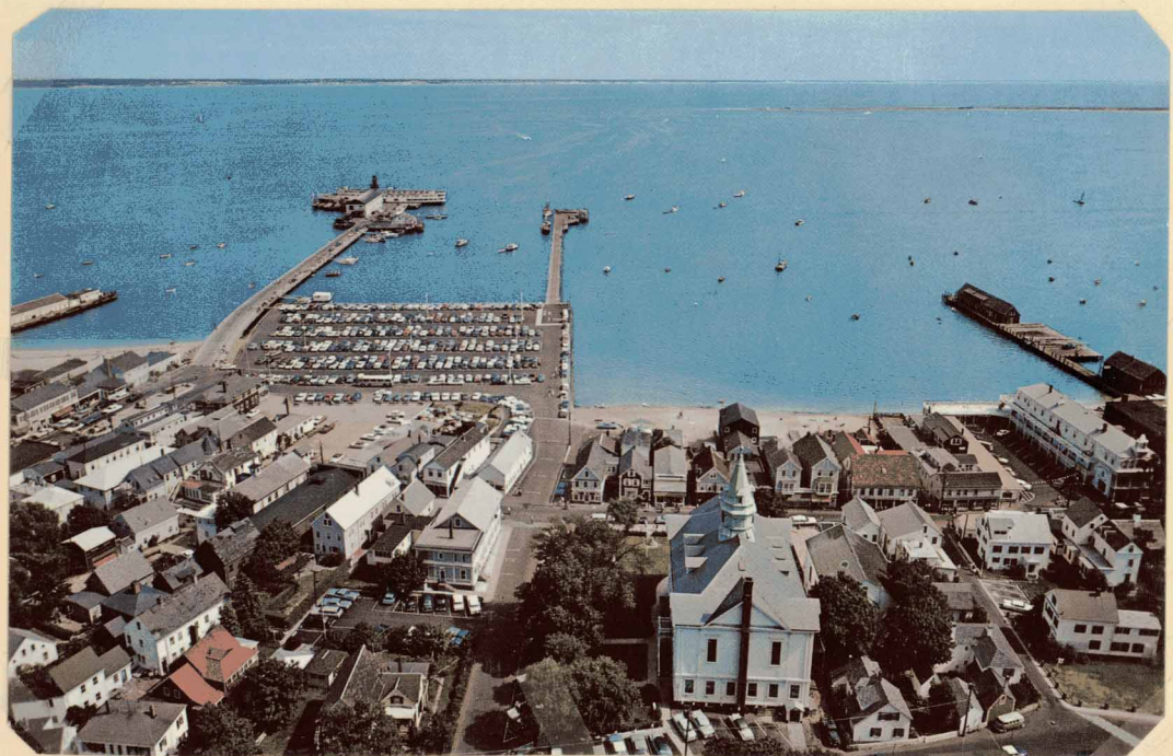
Showing the New Parking Lot between the two Wharves in 1965 - "Boston Belle" at Town Wharf