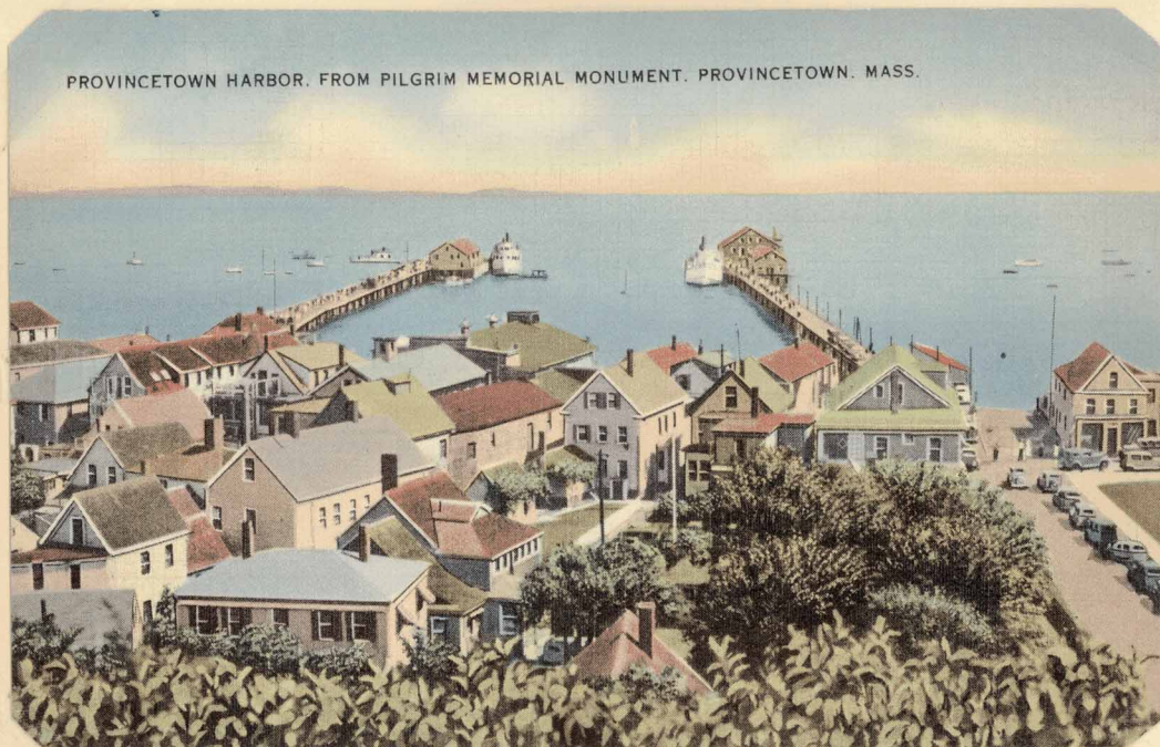
1945 with a Steamboat at Town & Sklaroff's Wharves