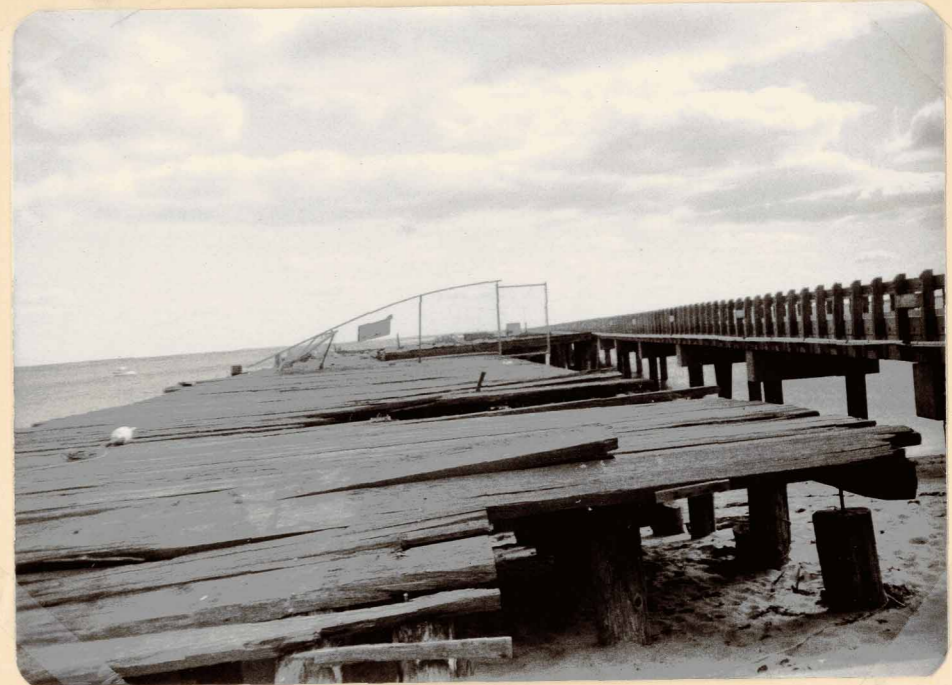
Remains of the Freeman Pier, left New Coast Guard Pier, right - October 1980