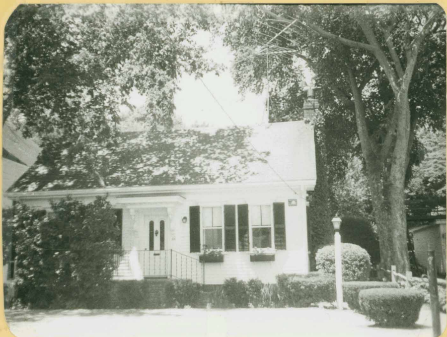
46 Commercial Street, opposite the Prince Freeman House. - June 18, 1981