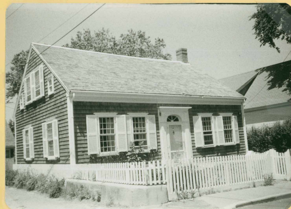
64 Commercial Street - - - June 18, 1981