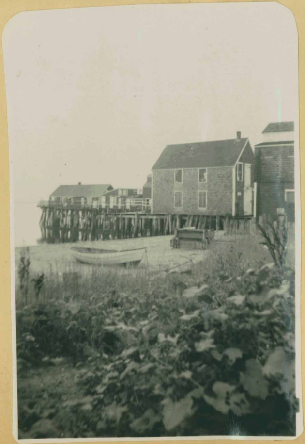
Where the Wharf Theater was. -September 1948