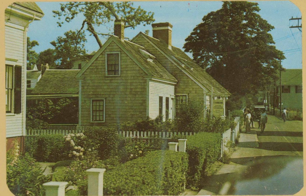
THE OLDEST HOUSE, PROVINCETOWN, CAPE COD, MASS. This old Cape Cod house was built about 1747.

This house is on the corner of Soper Street (just beyond the people. See next pages.) Taken 1951.