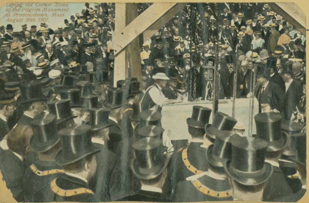
Laying the Corner Stone of the Pilgrim Monument at Provincetown, Mass. August 20th, 1907.