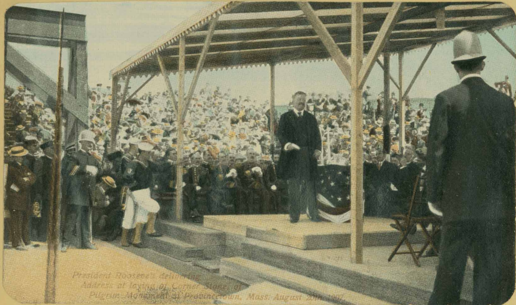
President Roosevelt delivering Address at laying of Corner Stone of Pilgrim Monument at Provincetown, Mass. August 20th, 1907.