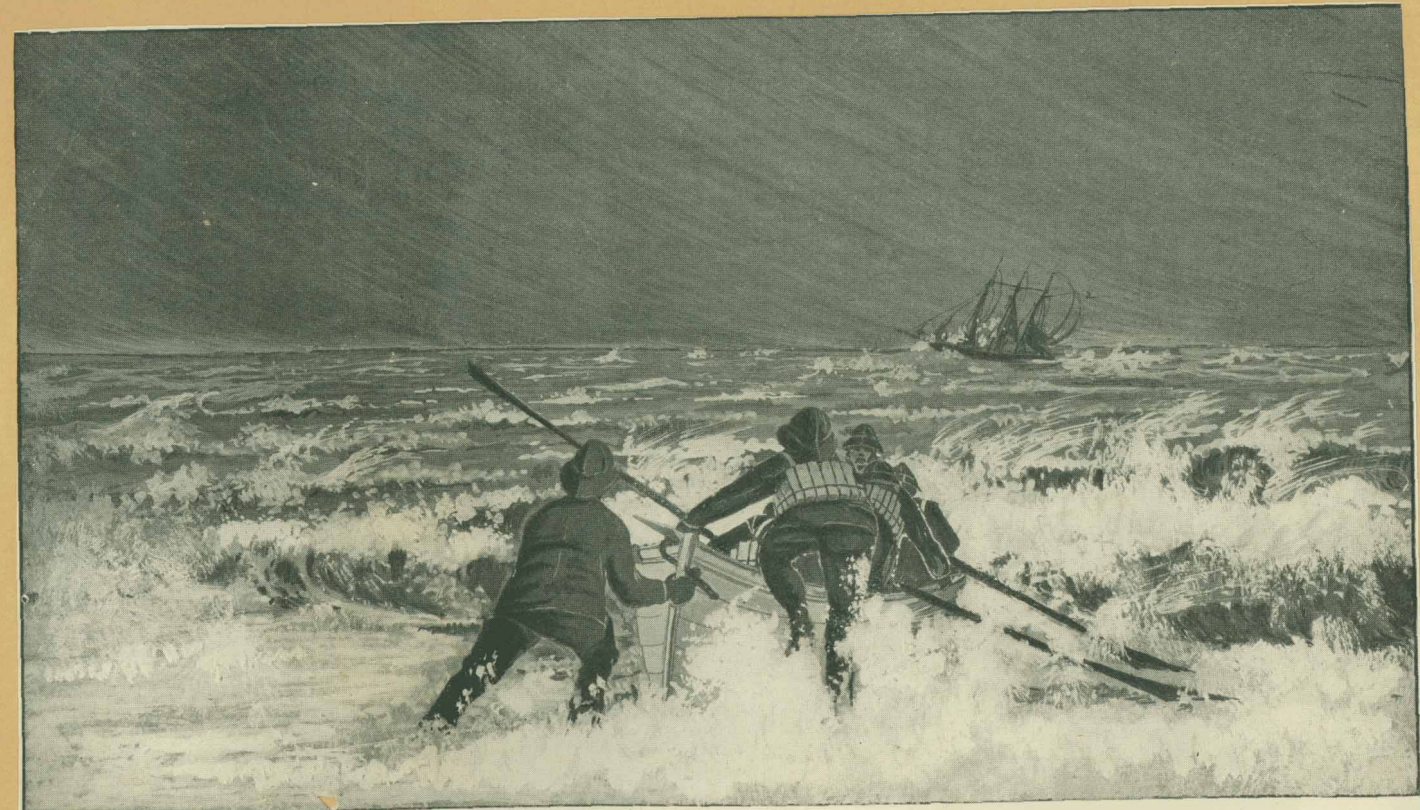
GOING OFF TO A WRECK.

The work of burying the sand anchor, getting the crotch, whip line, hawser, and breeches-buoy ready is speedily accomplished. Torches are kept burning by the life savers to tell those on the wrecked vessel that assistance is at hand and the life savers are at work, and even if the imperiled crew do not hear the report of the gun, which has fired