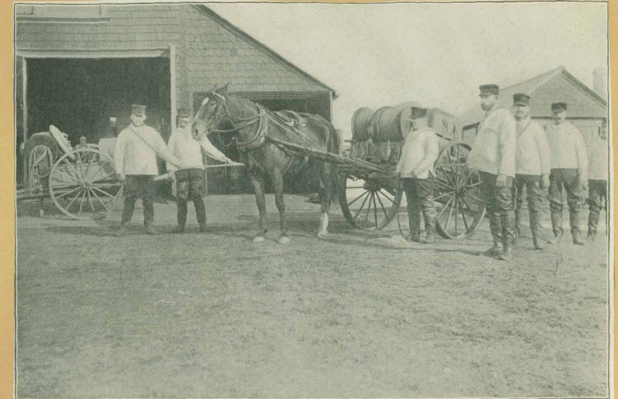
THE BEACH CART, MEN, AND HORSE, WITH HARNESS ON, READY TO GO TO A WRECK.

The captain, with the shore end of the shot-line in his hand, waits for a signal from the ship that the line has passed over the vessel, and